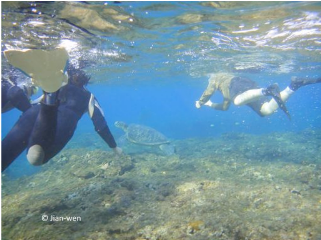
Picture 19. Foraging green turtles