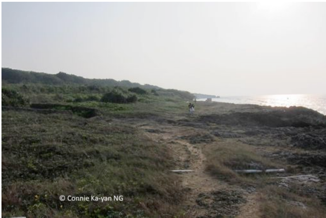
Picture 10. Camping Area, north of Liugu Island