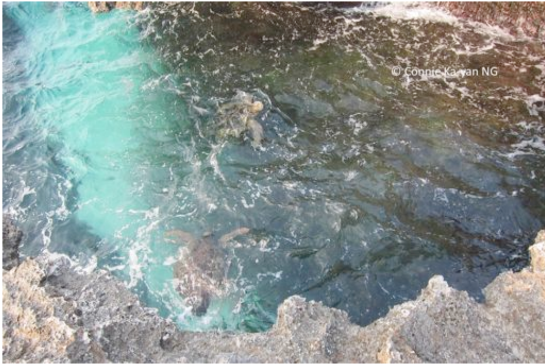
Picture 11. Two foraging green turtles in coastal waters of Camping Area