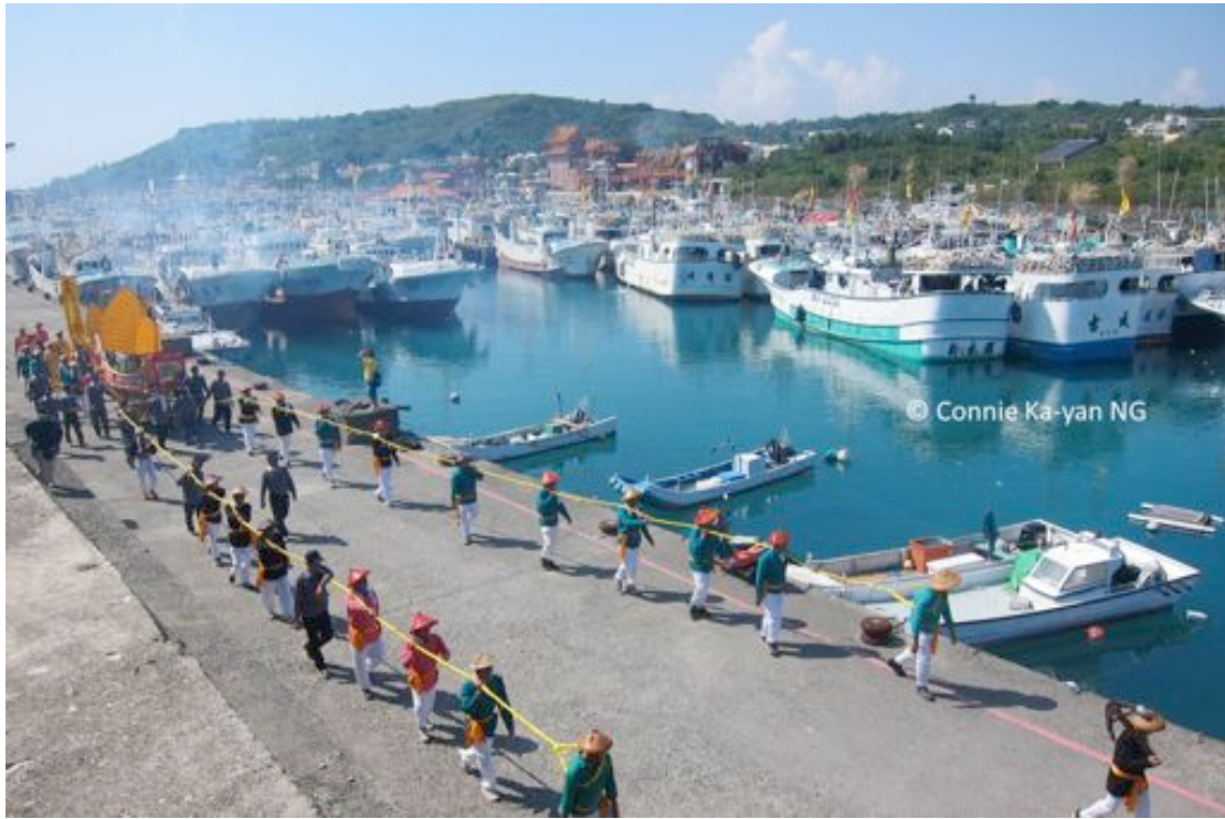
Picture 3. Local people carried the Wangye boat around Liuqiu