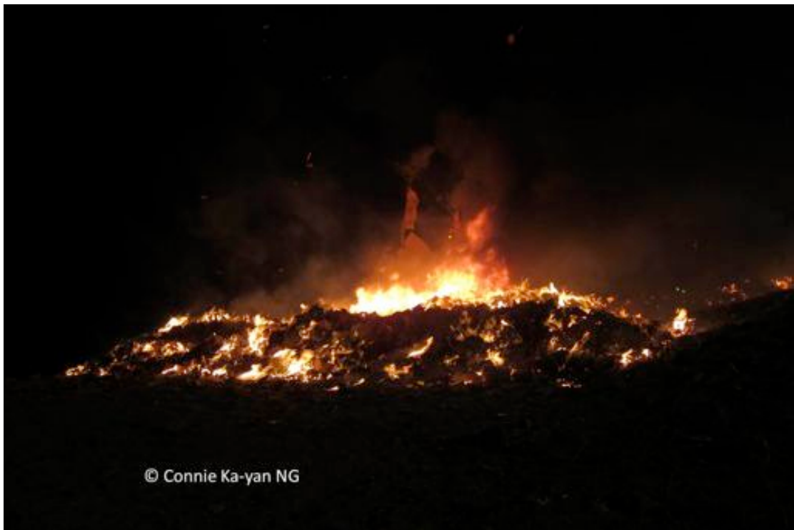
Picture 8. Burning of the Wangye boat with paper money