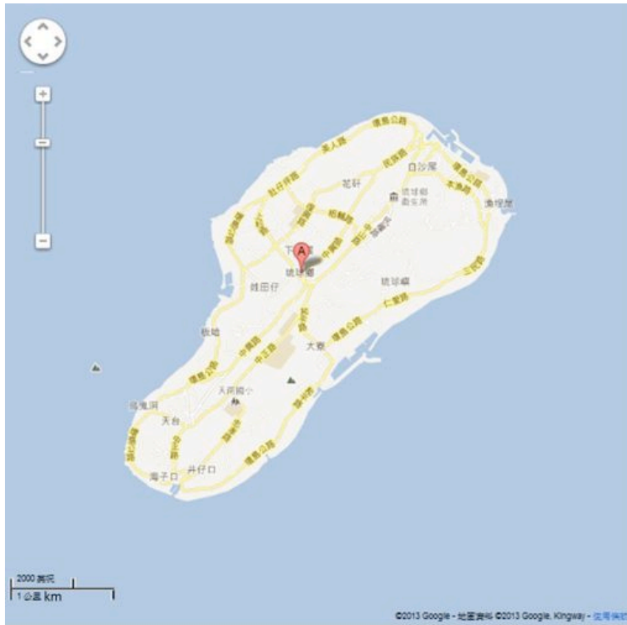
Map 2 showing the location of Liuqiu Island, Taiwan 台灣小琉球島的位置