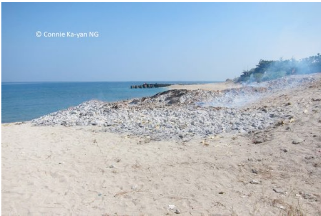
Picture 9. Burning of the Wangye boat with paper money