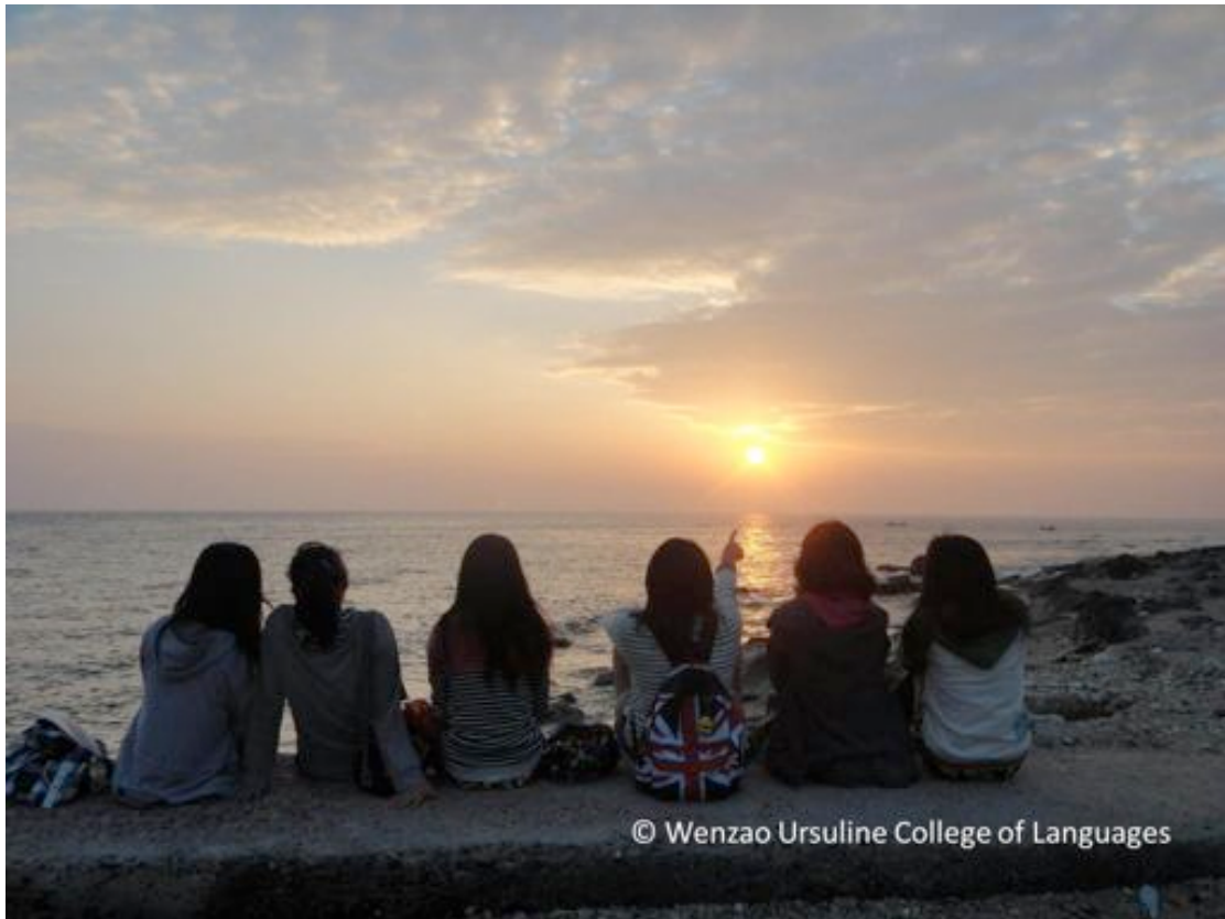
Picture 25. Amazingly beautiful sunset and a group of teenage girls on Liuqiu Island