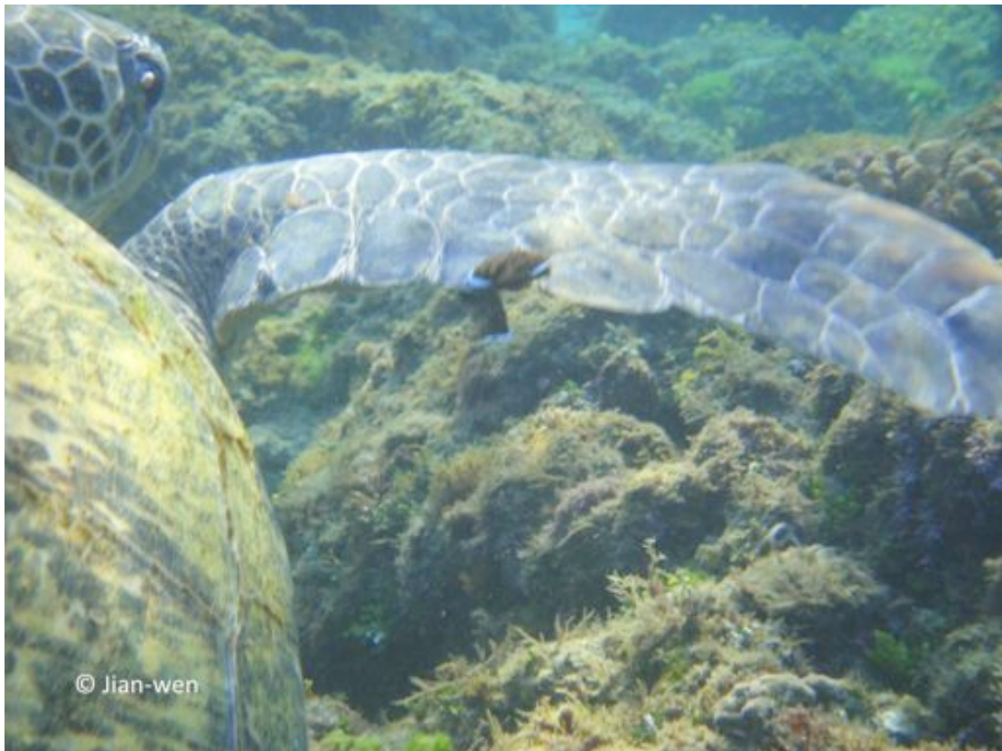
Picture 22. A blue plastic tag, with algae overgrown, on the right forelimb of a large female green turtle 圖22. 雌性綠海龜右前肢附有一個長滿藻類的藍色塑料標籤