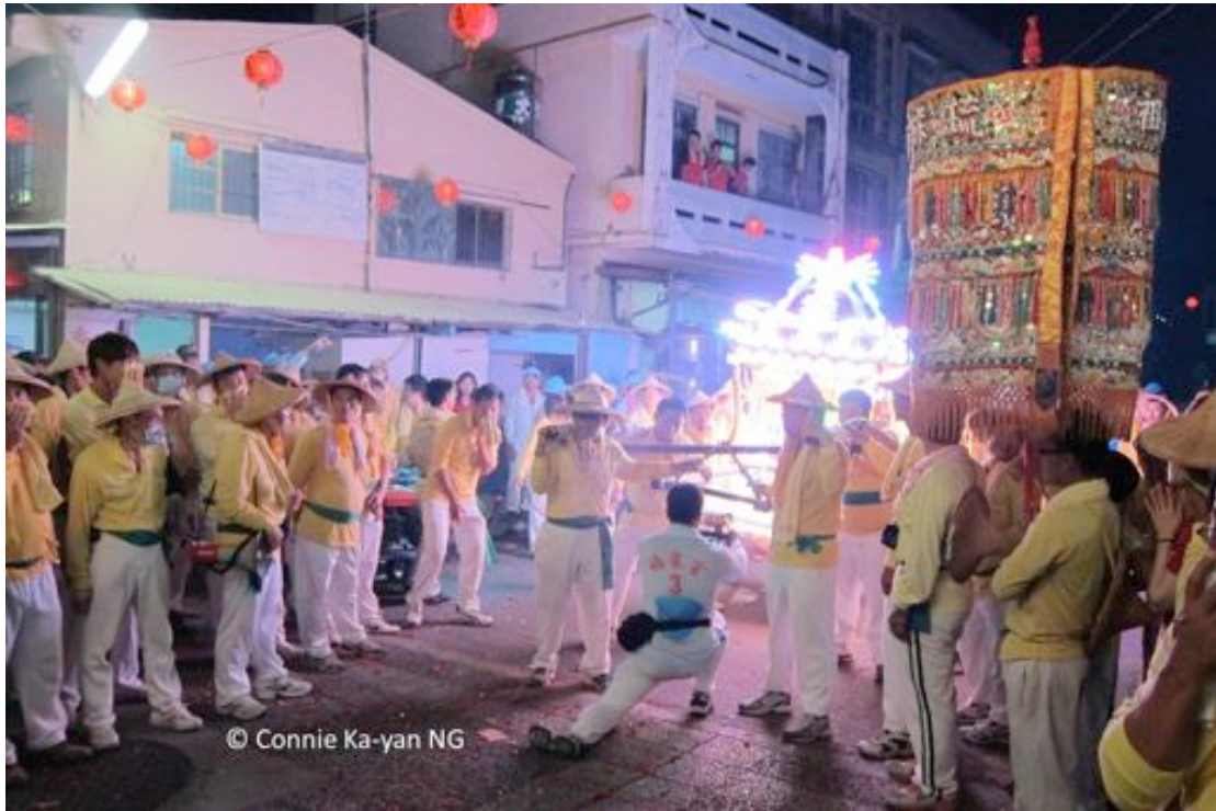
Picture 1. Palanquin of Wangye carried by the locals on Liuqiu Island