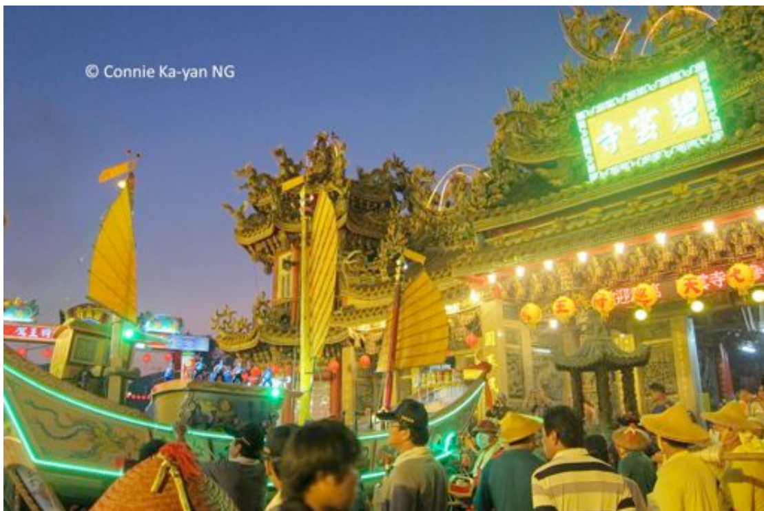
Picture 6. Wangye boat stationed in one of the local temples