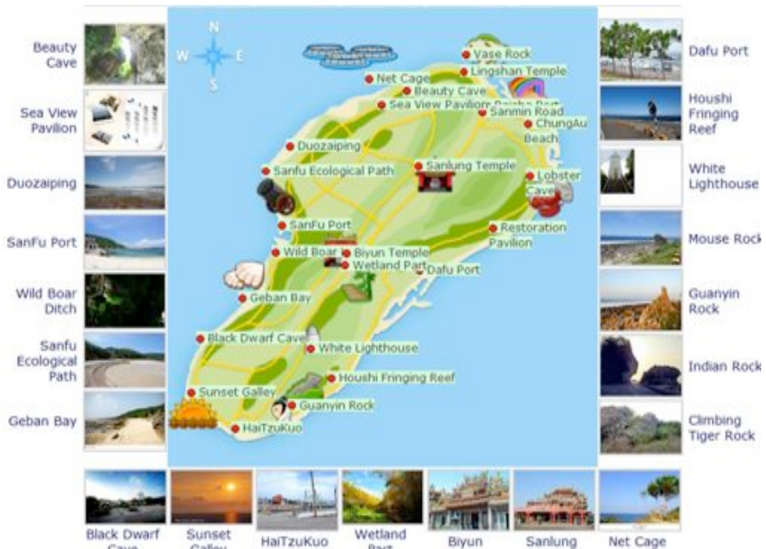
Map 3 showing the scenic spots of Liuqiu Island, Taiwan 台灣小琉球島的風景名勝區