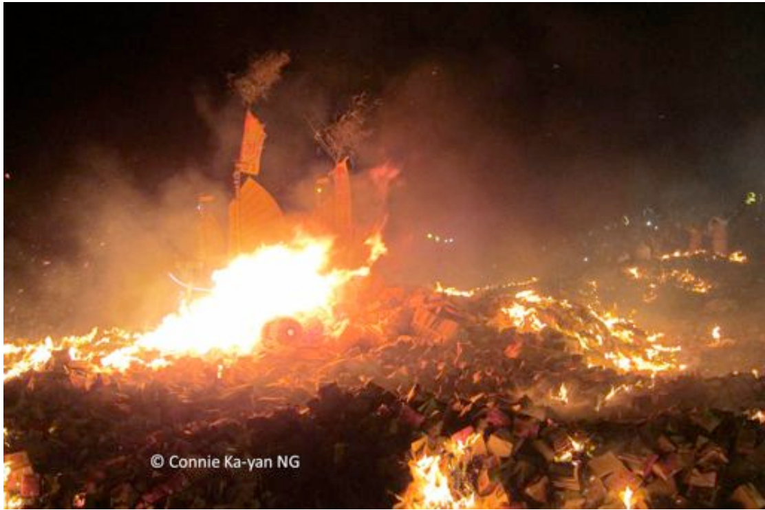
Picture 7. Burning of the Wangye boat with paper money