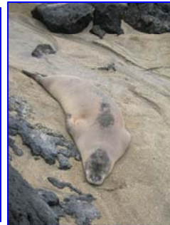
Left: Pictures of R042 resting at Omokaa Bay Beach and likely starting to molt.