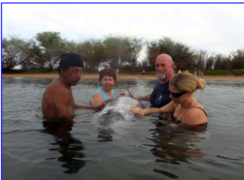
Volunteers carefully held the Risso's dolphin in shallow waters.