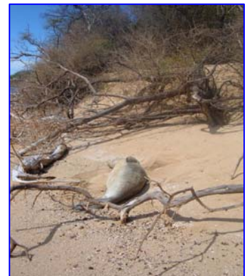
This monk seal was hiding amongst tree limbs and almost missed on Molokai.

small issues, most would agree that this was another successful undertaking. New partnerships were formed, and the network capacity was enhanced as most of the neighbor islands had an increase in the volunteer participation.