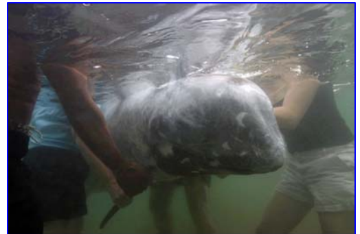
Underwater photo of the Risso's dolphin.

The dolphin was held in shallow water for approximately four hours. The dolphin's body was listing to the left, and there was some evidence of reef rash in addition to several fresh, small wounds that were possibly cookie cutter shark bites. There was "lice" in and around fresh wounds, and the dolphin was fairly lethargic with its eyes closed. When a shark was spotted, the dolphin's eyes opened and it became very active. The dolphin suddenly became very agitated as the shark appeared to swim toward it. When the shark was spotted in the water close to the dolphin and handlers, the dolphin was released for three reasons: 1) the dolphin began thrashing and moving wildly with the potential to cause harm to the handlers; 2) the chance of a shark attack increased dramatically; and 3) the distance was too great and there was not enough time to safely bring the dolphin to shore before the shark potentially reached them. The handlers released the dolphin and safely came to shore. When the dolphin was released, it was already pulling away from the handlers and as it swam off, it was still listing to the left.