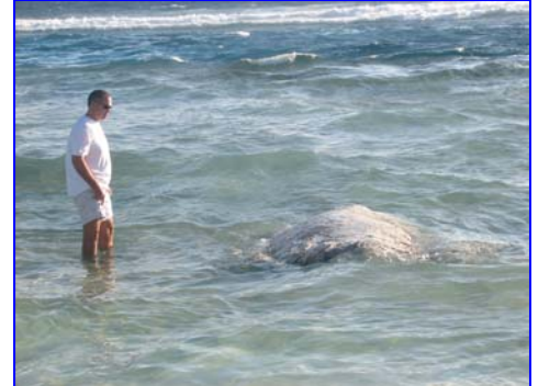
Left: A 4.8 m short-finned pilot whale stranded on November 21, 2007, at a beach on Emau Island, Central Vanuatu. No obvious cause of death. A skin sample was obtained and sent for genetic analysis (Submitted by Francis Hickey). Center: Unidentified floating dead whale off Fiji in November 2007. Right: An unidentified "hunk of whale" that came ashore on December 17, 2007, on the Marshall Islands. Tissue samples are being sent off for toxicology and genetic analysis.