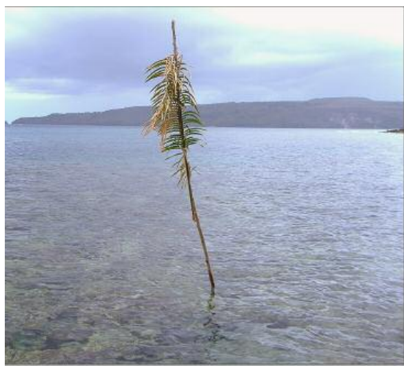
Figure 2. A namele leaf recently placed after a pig killing ceremony used to indicate a reef tabu at Mangaliliu village on Efate.