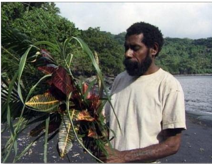
Figure 3. A traditional leader in the Banks Islands placing the taboo leaves unique to his cultural group to indicate a reef taboo.

kava, woven mats and other traditional wealth items as an additional deterrent and means of removing the “wrong” in the eyes of ancestors and other clan members. Typically, ancestral spirits would punish transgressors, or their family members, by making them ill, sometimes terminally so. Some were capable of assuming various forms, including sharks or barracuda that could directly enforce a marine taboo. Practices to ensure the participation of ancestors in enforcement included placing culturally specific taboo leaves in the area to symbolically monitor and enforce the taboo (Fig. 3). Communication with the spirit world was often enhanced by ritualized kava drinking.