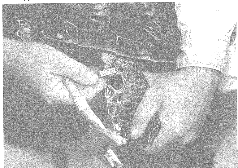
Figure 2. Style 681C Inconel tag attached to the hind flipper of a juvenile green turtle. The tag's piercing site is proximal of and adjacent to the first large scale. This tagging location seems to work well on nesting females. Discomfort to the turtle from applying the tag here is much less than when applied to a front flipper.