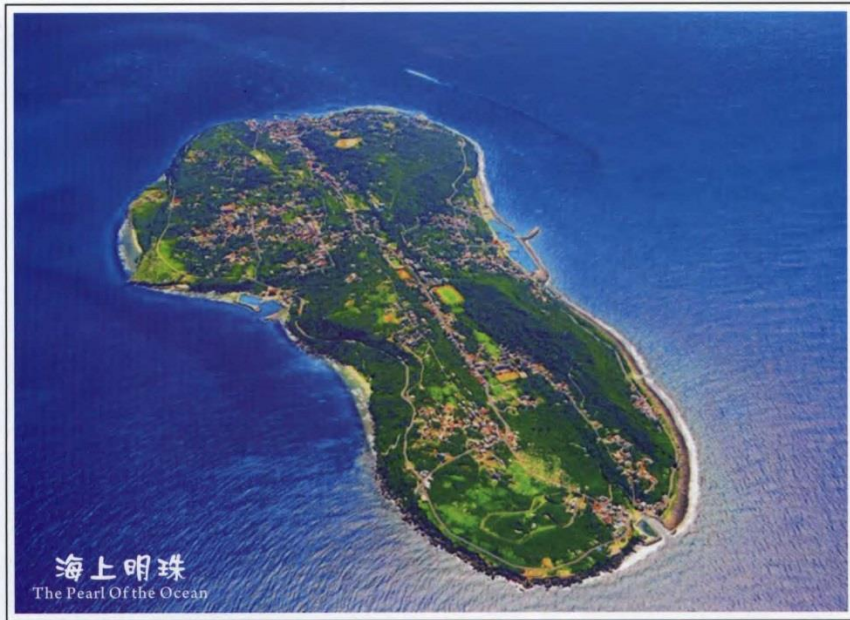
海上明珠 The Pearl Of the Ocean