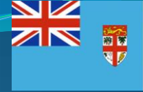
Fiji 1,129 km