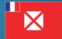
Wallis and Futuna 129 km