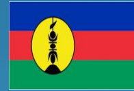
New Caledonia 36