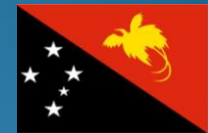
Papua New Guinea 5,152 km