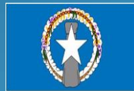
Commonwealth of Northern Mariana Islands 51,395