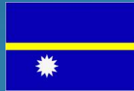
Nauru 30 km