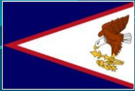
American Samoa 116 km