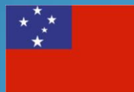
Samoa 403 km