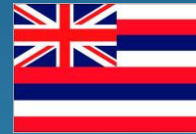
Hawaii 1,210 km