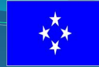
Federated States of Micronesia 6,112 km