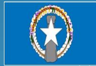
Commonwealth of Northern Mariana Islands 14