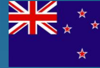
New Zealand 7