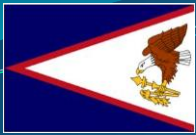
American Samoa 54,947