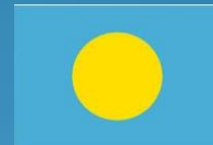
Palau 1,519 km