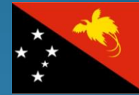
Papua New Guinea 151