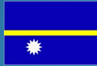
Nauru 30 km