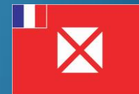
Wallis and Futuna 129 km