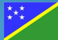
Solomon Islands 5,313 km