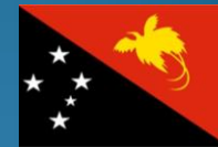
Papua New Guinea 5,152 km