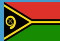
Vanuatu 2,528 km