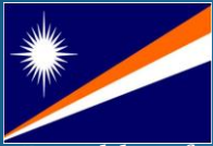
Republic of Marshall Islands 370 km