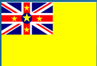
Niue 64 km