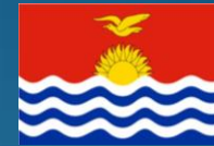
Kiribati 1,143 km