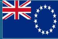
Cook Islands 120 km