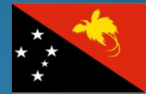
Papua New Guinea 6,310,129