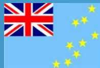
Tuvalu 24 km