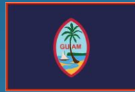
Guam 126 km