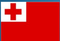
Tonga 419 km