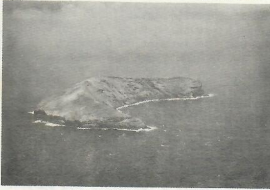
Fig. 1. Kaula Island viewed from the south-east. The curving crest of the island is 5,500 feet long with a maximum width of 1,650 feet.