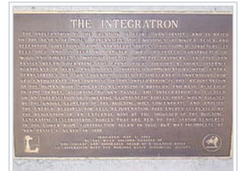
Historical marker near Integratron in Landers