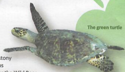
The green turtle

Abundant in coral resources, Xiao Liuqiu has more than 200 stony corals (Scleractinia). Purple crabs ( Gecarcoideaalalandii ) are all over the Wild Boar Trench in the summer night after rain. Rock-boring urchin ( Echinometramathaei ) and millipede brittle star ( Ophiocomascolopendrina ) are the most advantageous "spiny-skinned" animals (Echinoderms) which take shelter in rock crevices in intertidal zone. Green sea turtles are also plenty at Xiao Liuqiu. To observe the turtles, simply go to the scenic pavilion at the Beauty Cave!