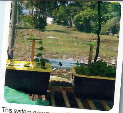
This system grows vegetable plants which are then sold – vegetables are in very short supply in Kiribati because of the lack of soil.