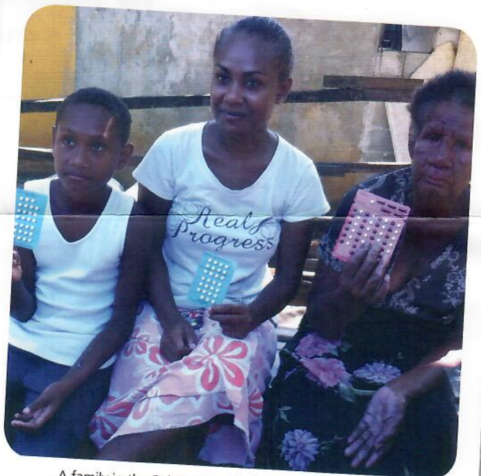
A family in the Solomons with their leprosy medication.