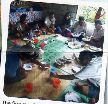
The first meeting of the leprosy patients' co-operative.