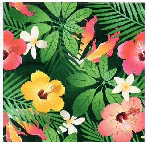
New Hibiscus Design