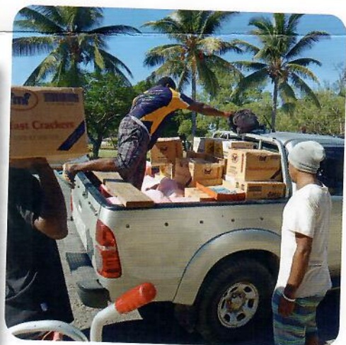
Packing the truck with food items for patients affected by Cyclone Oma.