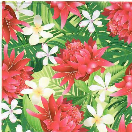
Torch Lily Design

These cards can be purchased through our website, or by telephoning the office on 03 343 3685.