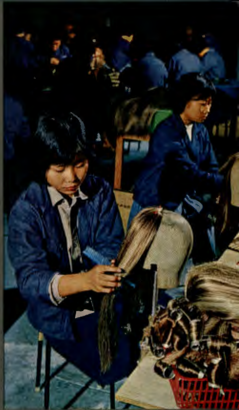
KODACHROME (ABOVE) AND EKTACHROMES © N.G.S.

WIGMAKER COMBS A HAIRPIECE in the Export Processing Zone at Kaohsiung. Human hair, much of it imported duty-free from other Asian lands, is made into wigs for sale abroad.