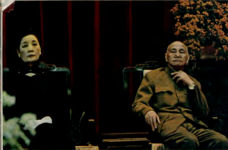
Portraits of patience, 81-year-old Chiang Kai-shek and his wife still long for home after nearly 20 years in exile. They watch a birthday salute to her brother-in-law, Sun Yat-sen (pages 2-3).