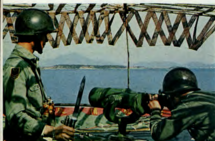
Eyeing the enemy, Nationalist troops on Quemoy stay on alert. They live under periodic shelling from Communist guns, some of them on another island only 2,500 yards away.