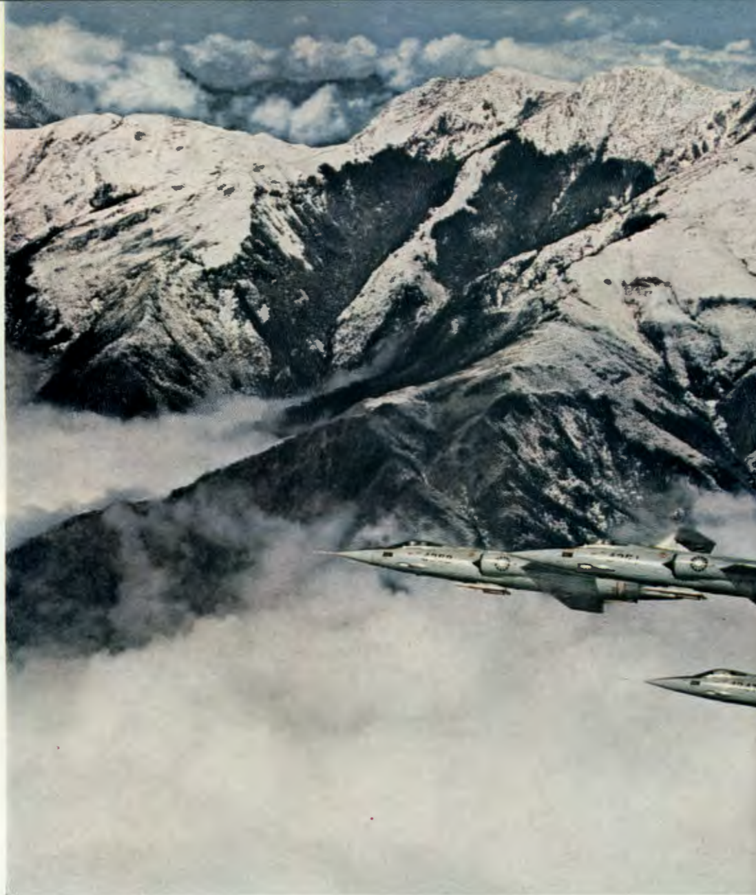
“Flying Dragon” Squadron Lockheed F-104 Starfighters of the 100,000-man Republic of China Air Force flash past Taiwan’s highest peak, 13,113-foot Yu Shan, or Jade Moun-

parts of the mainland [page 12]. Our loudspeakers are clearly heard. But the Communists have speakers too. Listen.”