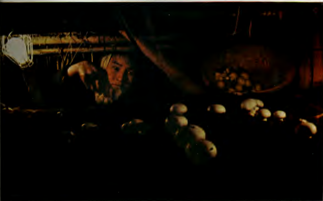
EKTACHROME (ABOVE) AND KODACHROMES