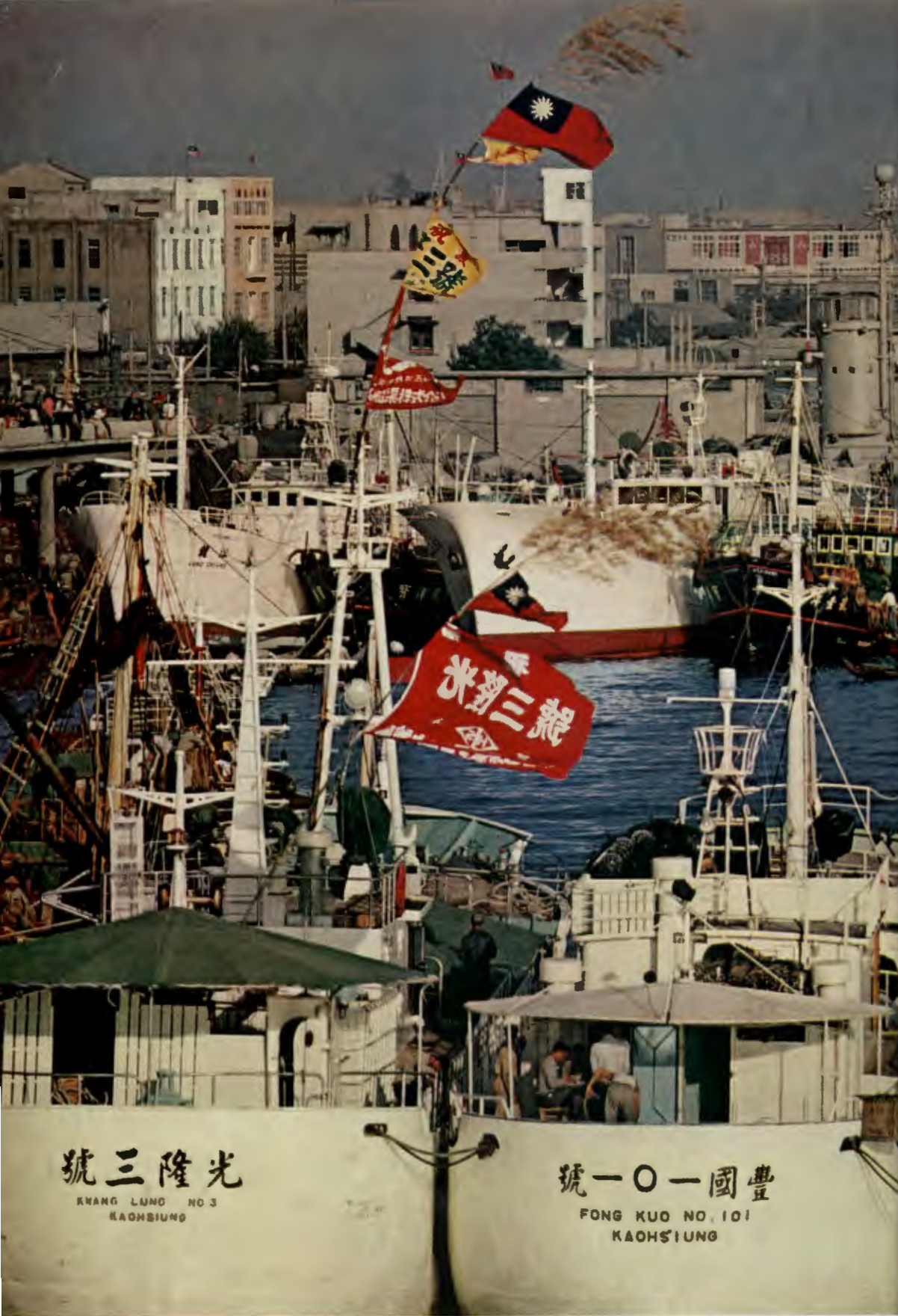
Fishing fleet, freighters, and ships of the Republic of China Navy share dock space at Kaohsiung, Taiwan's main port. Good-luck flags flying on bamboo staffs