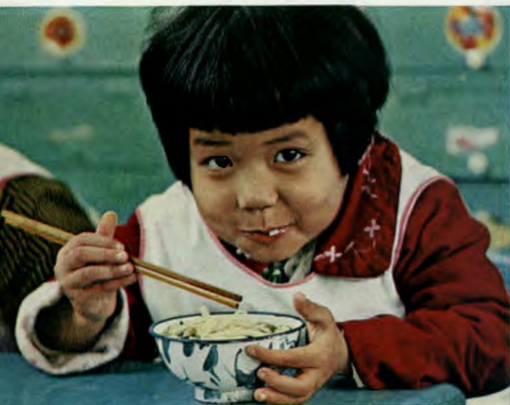
EXTACHROMES (©) NATIONAL GEOGRAPHIC SOCIETY

Simple fare suits a child who enjoys steaming noodles for lunch in her Quemoy kindergarten on a brisk December day.