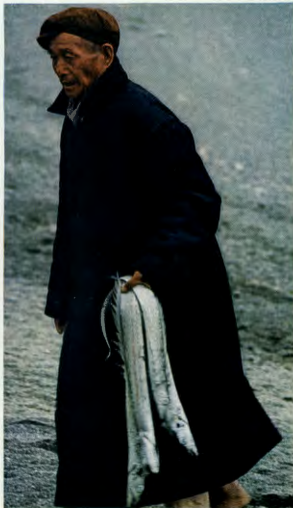
EKTACHROME (ABOVE) AND KODACHROME © N.G.S.

Tom explained how it works: Massive 200,000-ton ships—specially built to handle cargo in sealed standard-size containers—would leave European and American ports bound for Asia. But instead of stopping at