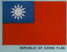
REPUBLIC OF CHINA FLAG

439 people per square mile in 1949 to 1963 today, one of the world's highest.