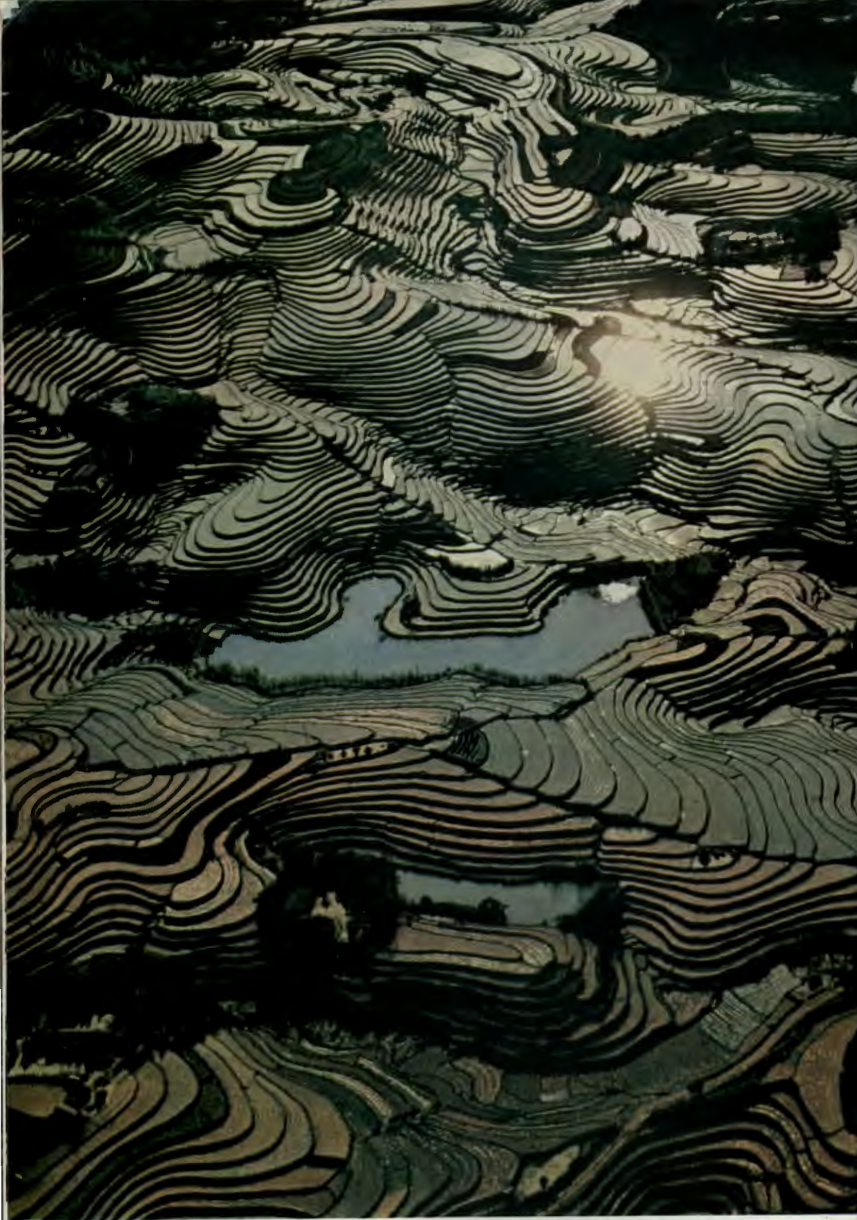
Swirling contours of terraced paddies wrinkle the face of Taiwan north of Taipei. Rice growers use almost every inch of arable earth—only a fourth of the island—to feed an exploding population.