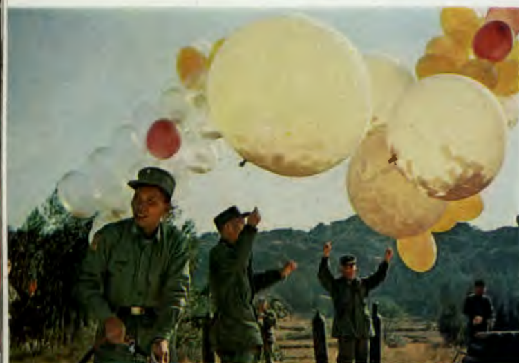
War of words. Balloons containing propaganda leaflets ride one-way winds from the island of Quemoy to the mainland. Nationalists also wage loudspeaker duels with the Communists.