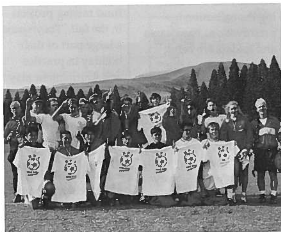
Boys' team celebrates BIIF soccer championship.

From the ongoing project, it is becoming more apparent that Kiholo Bay and its attendant lagoon is an important and perhaps the sole habitat for a population of 200-plus green sea turtles and a small number of hawksbill turtles. To better inform the public of the presence of these two species of sea turtles, signs have been placed in the area stating that they are protected under federal and state law.