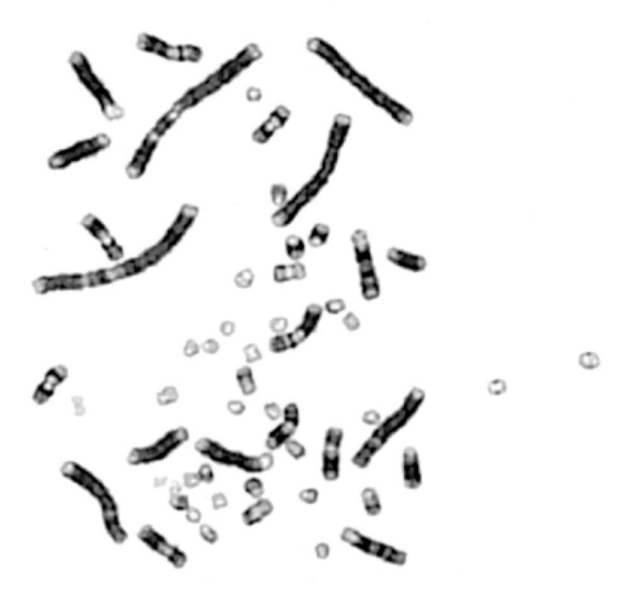
Figure 1. G-banding and metaphase of Chelonia mydas chromosomes with diploid number of 56.

no additional maintenance, and then successfully subcultured these cells. In addition, cell cultures derived from green turtle embryonic organs can be frozen, thawed, and then subcultured many times, unlike those from avian embryonic organs, which we have not been able to pass beyond passage two. We do not known if these differences are characteristic of GTE cells or of reptilian cells in general. Further work will be necessary in order to answer this question. These positive features of reptilian GTE cell cultures will, however, be beneficial in their use as a potential host for virus isolation. The procedures