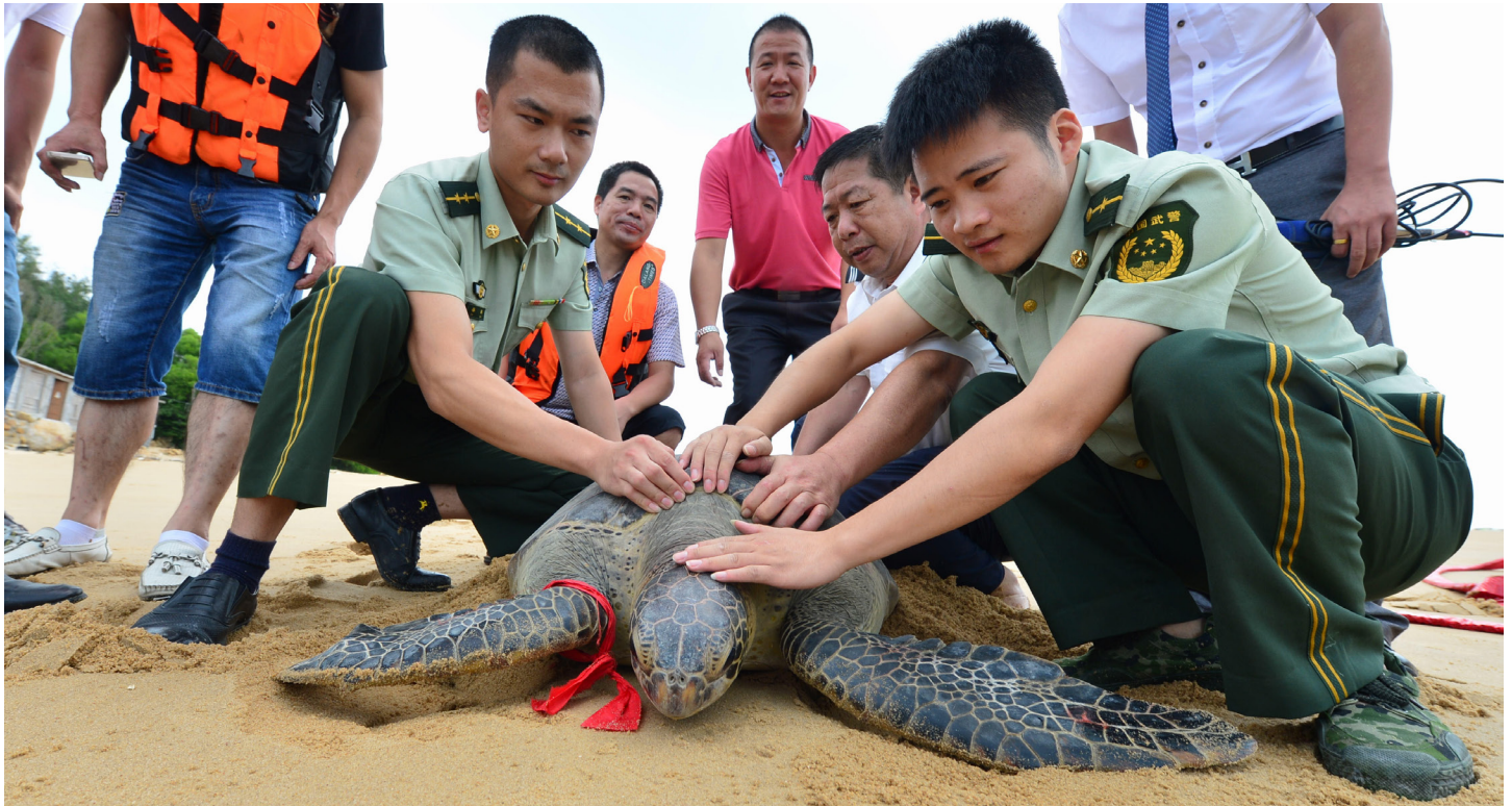
An accidentally-caught green turtle is released in Fujian Province © Xinhua_Alamy Sotck Photo.jpg

overall sustainability of sea turtle populations along China's coast, there are significant limitations to their effect on the country's impact on turtle populations globally, as these reserves predominantly target green turtles, rather than hawksbills.