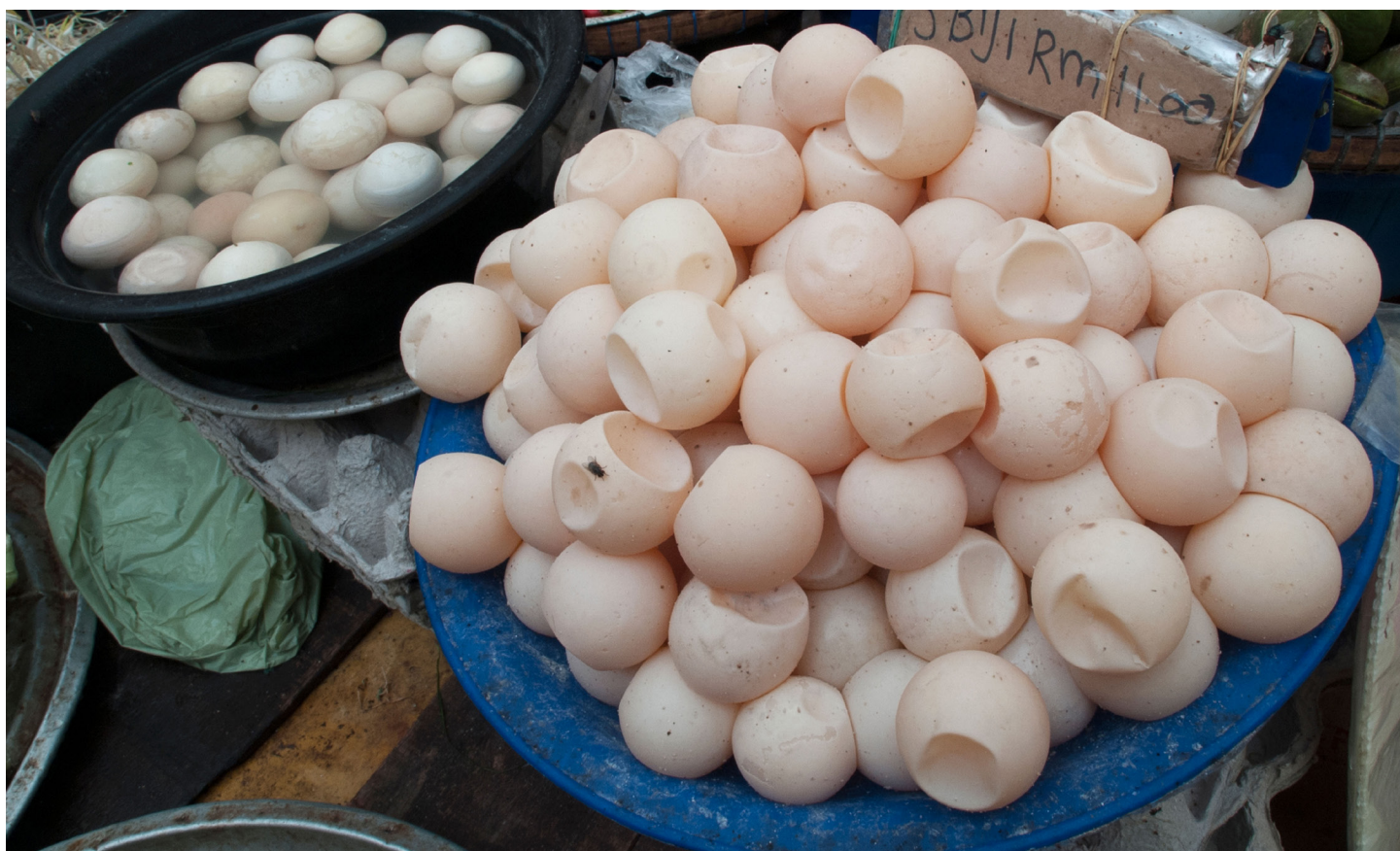
Turtle eggs for sale in Malaysia

Despite geographic separation, some common trends emerge across countries that consume turtle products. For example, several regions that use turtle parts for their medicinal effects commonly believe that consuming turtle parts can help cure asthma and improve male virility. The following table summarizes some representative drivers across regions that consume sea turtle products.