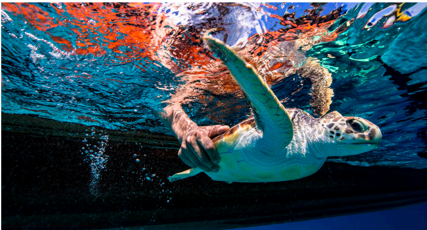
WildAid ambassador and actor Liu Ye releases a rescued sea turtle in the Paracel Islands

sale of tridacninae and its products. Although not targeting sea turtle products directly, the close association and clustering of the processing and sale of different marine wildlife products and the increase in law enforcement action against the sale of these products have generated direct impact on the industry overall as well as the economy of Tanmen, Qionghai, which used to depend on the processing and sale of the tridacninae and similar marine wildlife products.