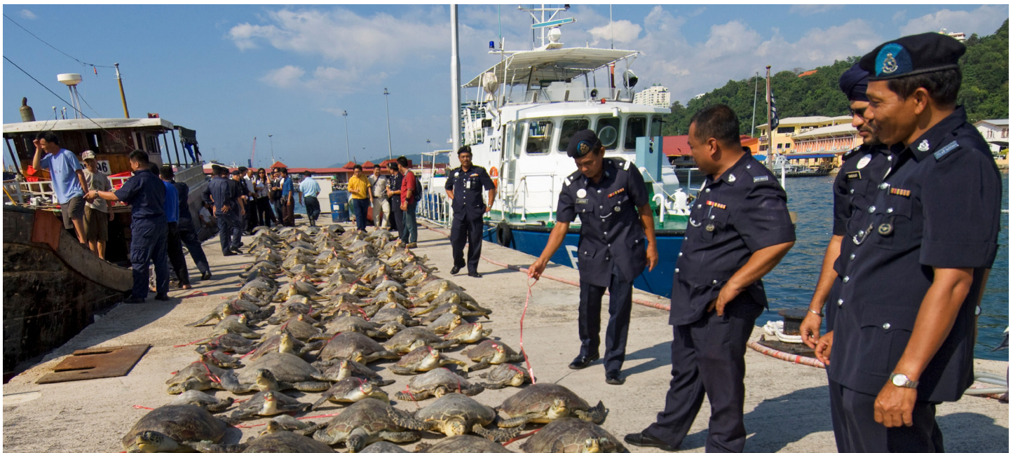
Sea Turtle Confiscation

k. http://www.dailymail.co.uk/wires/afp/article-4674788/Philippine-police-arrest-rare-sea-turtle-poachers.html