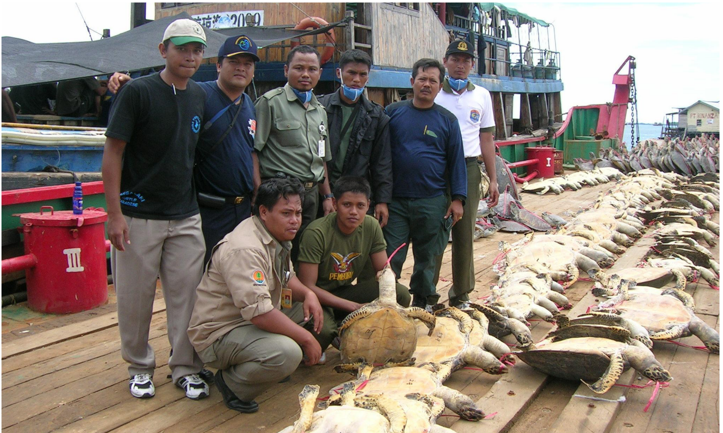
Sea Turtle Bust

“arts and crafts” market in Angola targeting mostly Chinese customers sell both ivory products and whole hawksbill taxidermies, and the San Jiang Market in the Laotian capital of Vientiane sell ivory, rhino horn, tiger bones, and hawksbill turtles side by side. 24