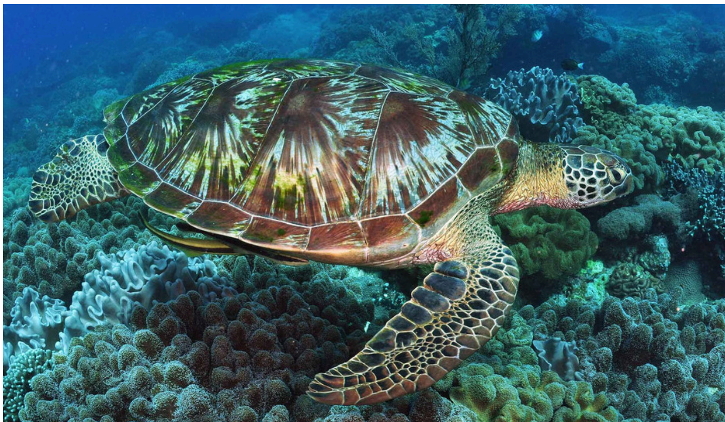
TABLE 6. CONFISCATION OF SEA TURTLE PRODUCTS FROM RETURNING TOURISTS AND INBOUND MAIL PACKAGES, 2015 - CURRENT (NON-EXHAUSTIVE)