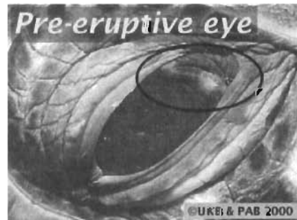
Figure 2. Pre-eruptive eye, showing discolouration.

The photographs showed the eyes of turtles found along the Kona/Kohala Coast of the Big Island of Hawaii, an area still free of