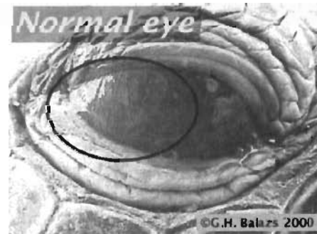
Figure 1. Normal eye, showing pleating of the posterior conjunctiva.

These results posed a dilemma. Although we have images of eyes that are free of tumours, FP is so prevalent at Honokowai that none of them could be used as a standard normal eye. Fortunately, co-author George Balazs provided photographs to use for this purpose.