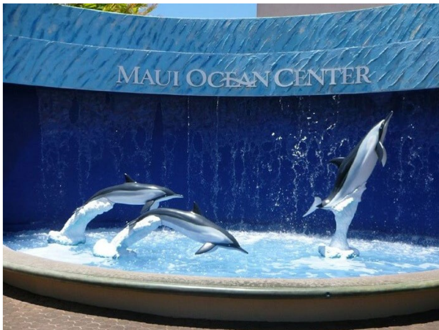
Maui Ocean Center

Ok if none of the above worked for you, we are not sure how, but if you have tried all the above and still not seen a turtle, even at Ho'okipi then all is not completely lost.