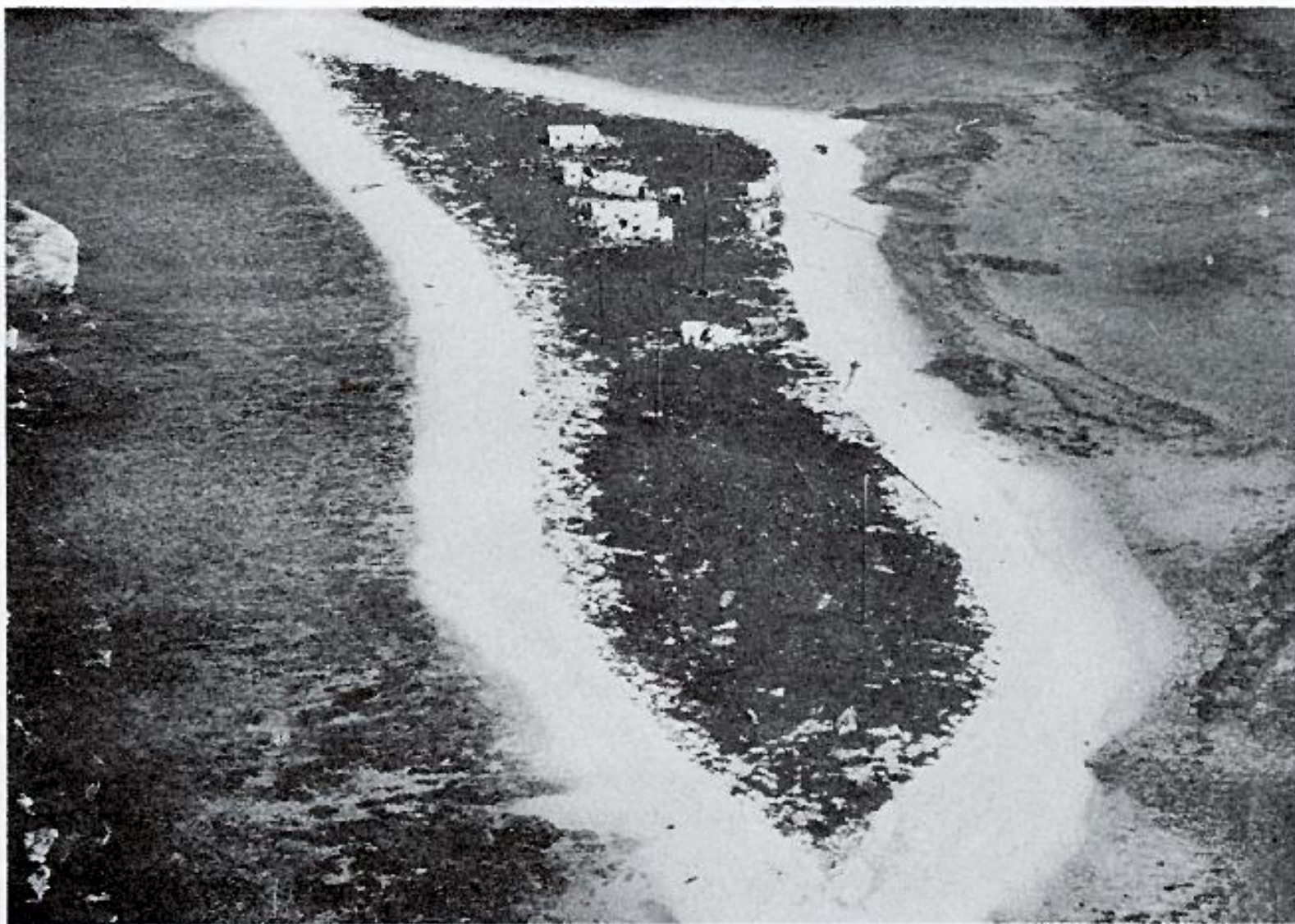
Figure 43. 'East Island's vegetation, June 1962.