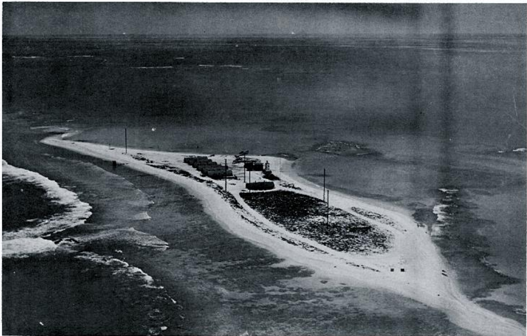
Figure 34. Newly constructed East Island Coast Guard LORAN Station, 24 April 1945.