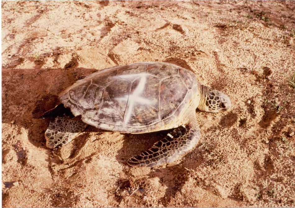
Figure 9.--Juvenile tag No. 4157-60, straight carapace length 58.5 cm, caught on 8 September 1985 at net location 3.