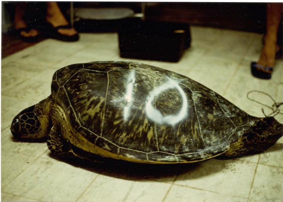
Figure 4.--Subadult tag No. 4170-73, straight carapace length 71.8 cm, caught on 9 September 1985 at net location 2.