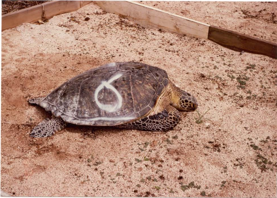
Figure 3.--Subadult tag No. 4153-56, straight carapace length 73.9 cm, caught on 8 September 1985 at net location 3.