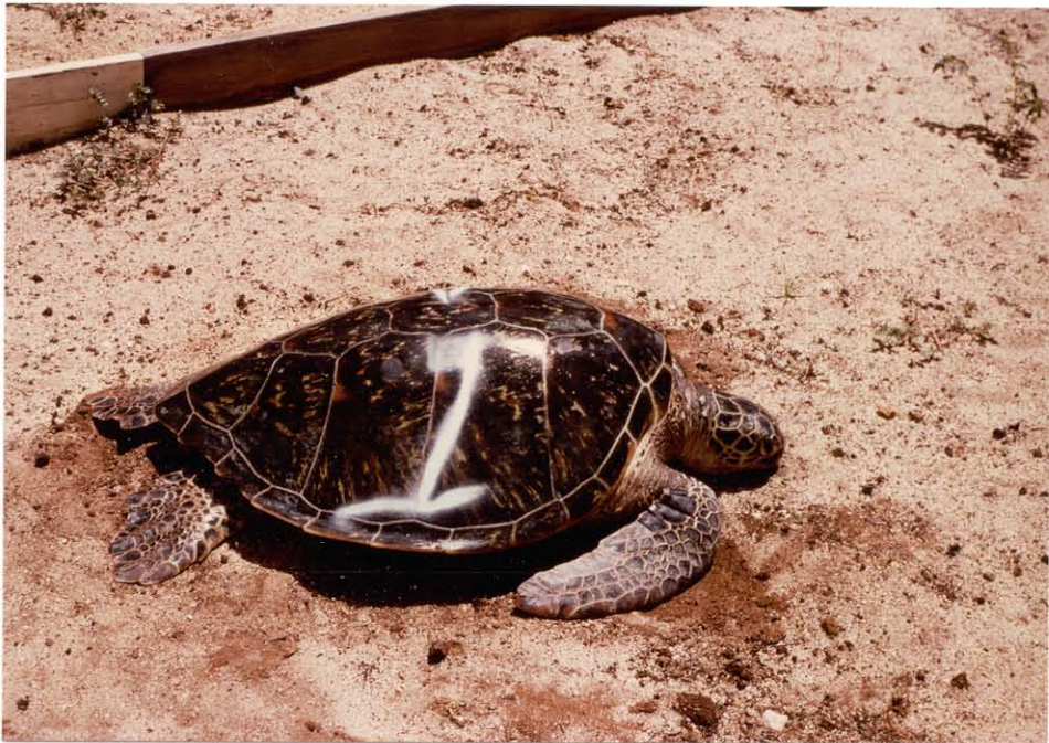
Figure 6.--Subadult tag No. 7433-36, straight carapace length 69.1 cm, caught on 2 September 1985 at net location 7.