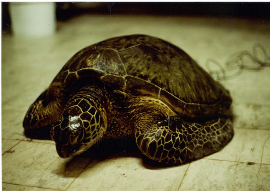
Figure 7.--Subadult tag No. 7449-50, 4151-52, straight carapace length 68.1 cm, caught on 5 September 1985 at net location 7.