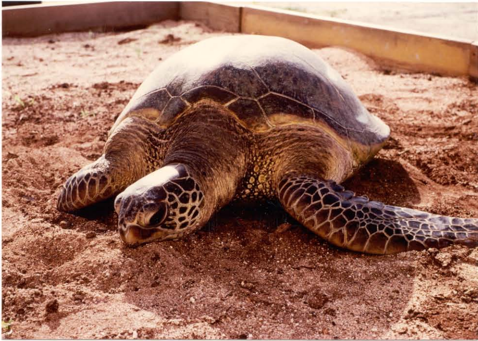
Figure 5.--Subadult tag No. 7441-44, straight carapace length 69.8 cm, caught on 3 September 1985 at net location 7.