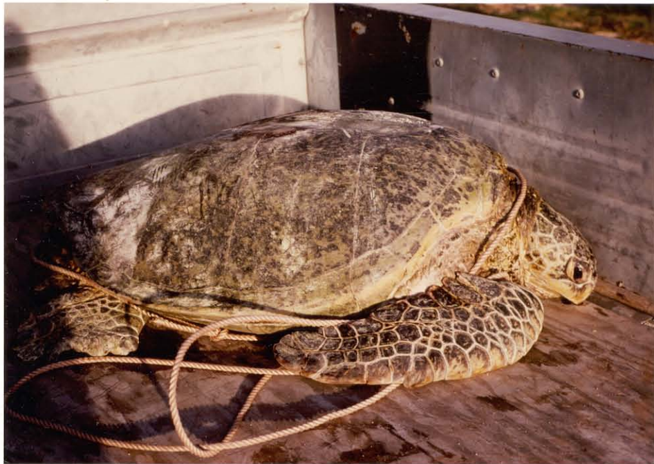
Figure 2.--Adult male, tag No. 4165-69, straight carapace length 86.5 cm, caught on 9 September 1985 at net location 3.