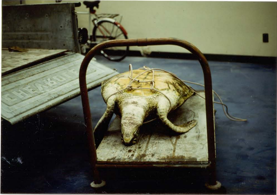
Figure 1.--Adult female, tag No. 7445-48, straight carapace length 88.4 cm, caught on 3 September 1985 at net location 3.