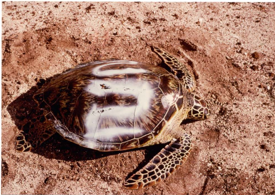
Figure 10.--Juvenile tag No. 7437-40, straight carapace length 50.4 cm, caught on 2 September 1985 at net location 7.