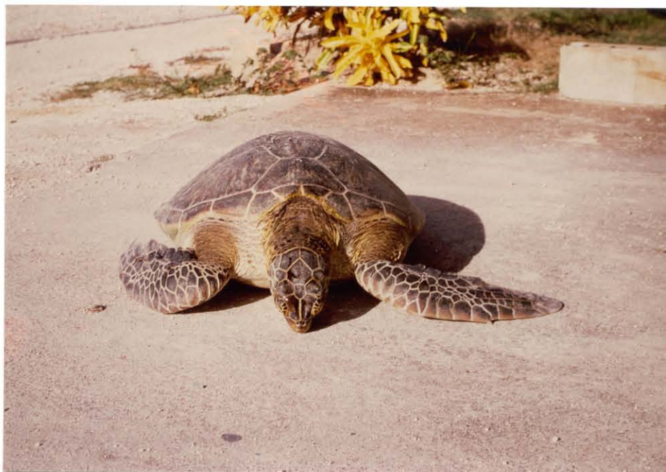
Figure 8.--Juvenile tag No 4161-64, straight carapace length 61.9 cm, caught on 9 September 1985 at net location 2.