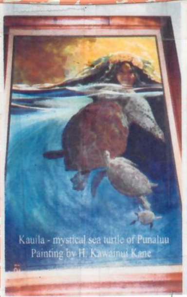
Kauila - mystical sea turtle of Punaluu Painting by H. Kawaiui Kane