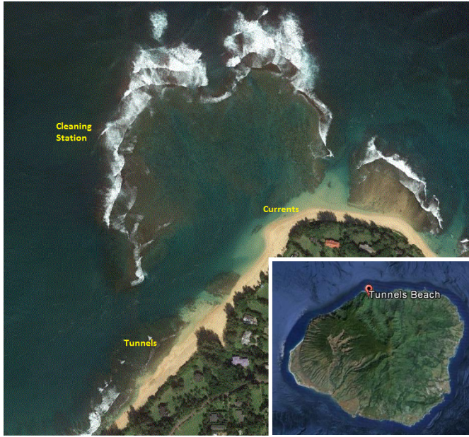
Figure 2. Locations surveyed at Tunnels on 14-15 July, 2015 with inset of location on Kauai.