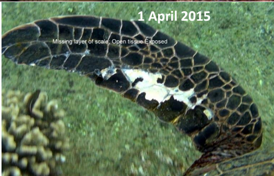
Figure 1. Representative clips of videos from Terry Lilley at various dates showing varying degrees of active and healed flipper lesions in green turtles from Tunnels. Captions on photos from Terry Lilley. Dates inserted by TM Work