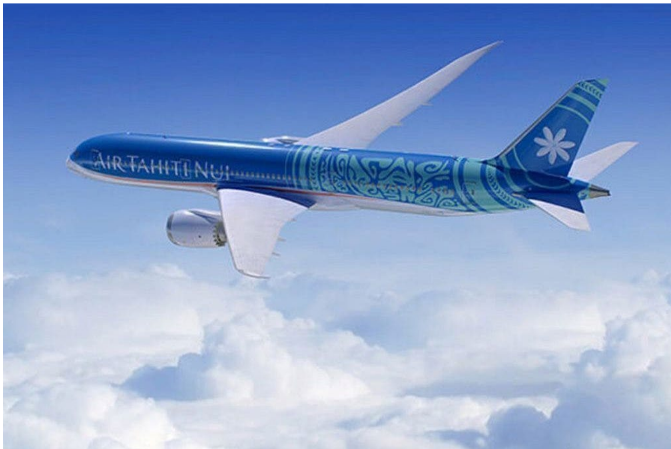
Every tattoo has a symbolic meaning.

The designers of the livery, Seattle-based design company Teague , told Nigam that they wanted to bring ethnicity to the plane, to show the Polynesian heritage. In the end, it was decided that the best way to do that would be through tattoos.