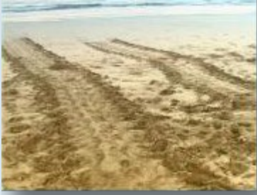
Lahaina, Maui: tracks of 5690 making her sixth nest in 2002.