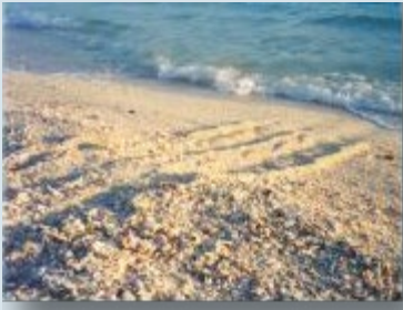
East Island, French Frigate Shoals, Hawaii.