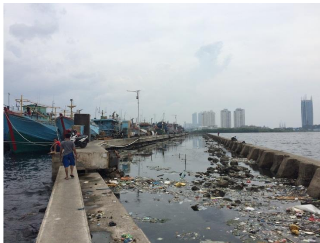
Figure 6. Elevated port wharf area in Jakarta, Indonesia (taken at high tide).