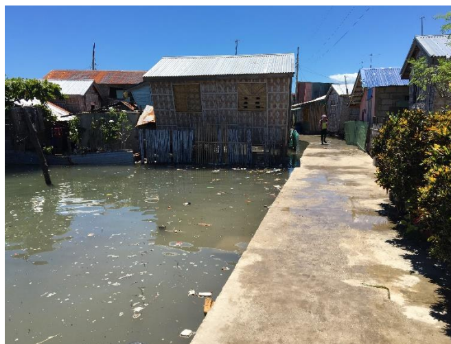
Figure 4. Elevated pathways along the houses. Ubay Island, off the coast of Bohol, Philippines (taken at high tide).