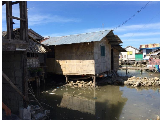
Figure 3. House on stilts, Batasan island, off the coast of Bohol, Philippines, during high tide.

Most importantly, to reduce disaster risk, the island communities have also adapted their evacuation behaviour. While prior to the earthquake they only evacuated during strong typhoons, they now also evacuate even during weaker weather systems such as tropical depressions, especially when these coincide with high tides. This showcases how different types of adaptation strategies can be employed, and while tidal flooding has redefined their new normal, islanders have easily adapted to “getting their feet wet” ever so often.