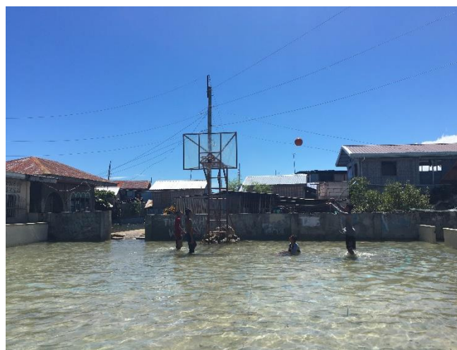
Figure 2. Basketball court in Ubay island, off the coast of Bohol, Philippines, during high tide.

However, to illustrate what would happen if earthquake-induced land subsidence occurred in an impoverished island community, it is worth looking at the case of the islands of Tubigon, Bohol in central Philippines. After a 7.2 magnitude earthquake with its epicentre in mainland Bohol in October 2013, four nearby island communities in the Municipality of Tubigon experienced land subsidence (probably in excess of one metre, Jamero et al., 2017) and began to suffer tidal flooding during normal high tides (see Figure 2). Prior to the earthquake, these islands only suffered tidal flooding whenever there were strong typhoons. Direct measurements conducted in 2016 showed that the islands became completely inundated during the highest tides of the year, with median flood levels reaching up to 20.5 - 43 cms, and partial flooding taking place between 44 and 135 days per year (Jamero et al, 2017). Tidal flooding happens over several days around the new and full moon, and lasts for an average of 3 to 4 hours. It may occur partially or completely throughout the entire year, depending on the tide level and local weather conditions.