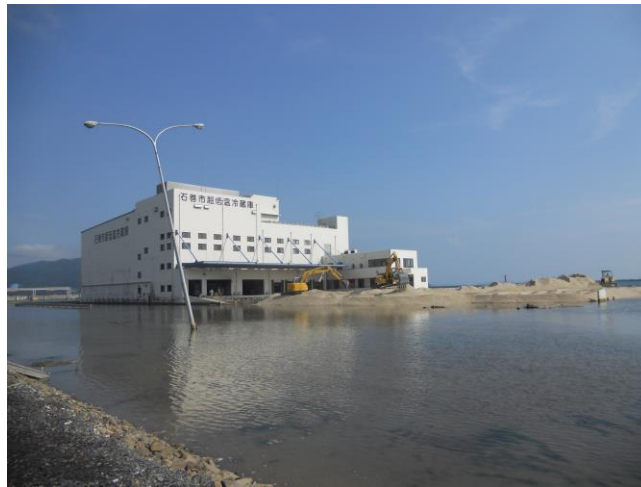
Figure 1. Left. The ground around coastal areas of Tohoku, Japan, subsided by 0.5-1.0 m. Photo taken in Ishinomaki port, 2011 during high tide.

reaching up to 120 cm (as reported by the Geospatial Information Authority of Japan). Originally, much of this area was part of what is referred to as the “Rias coastline”, where the mountains reach right up to the sea and only the end section of deep valleys is inhabited (typically by fishing villages and towns, see Mikami et al., 2012). As a result of the earthquake the ground sank, and much of the coastline was barely above mean sea level, with large portions of it being flooded at high tide(see Fig. 1).