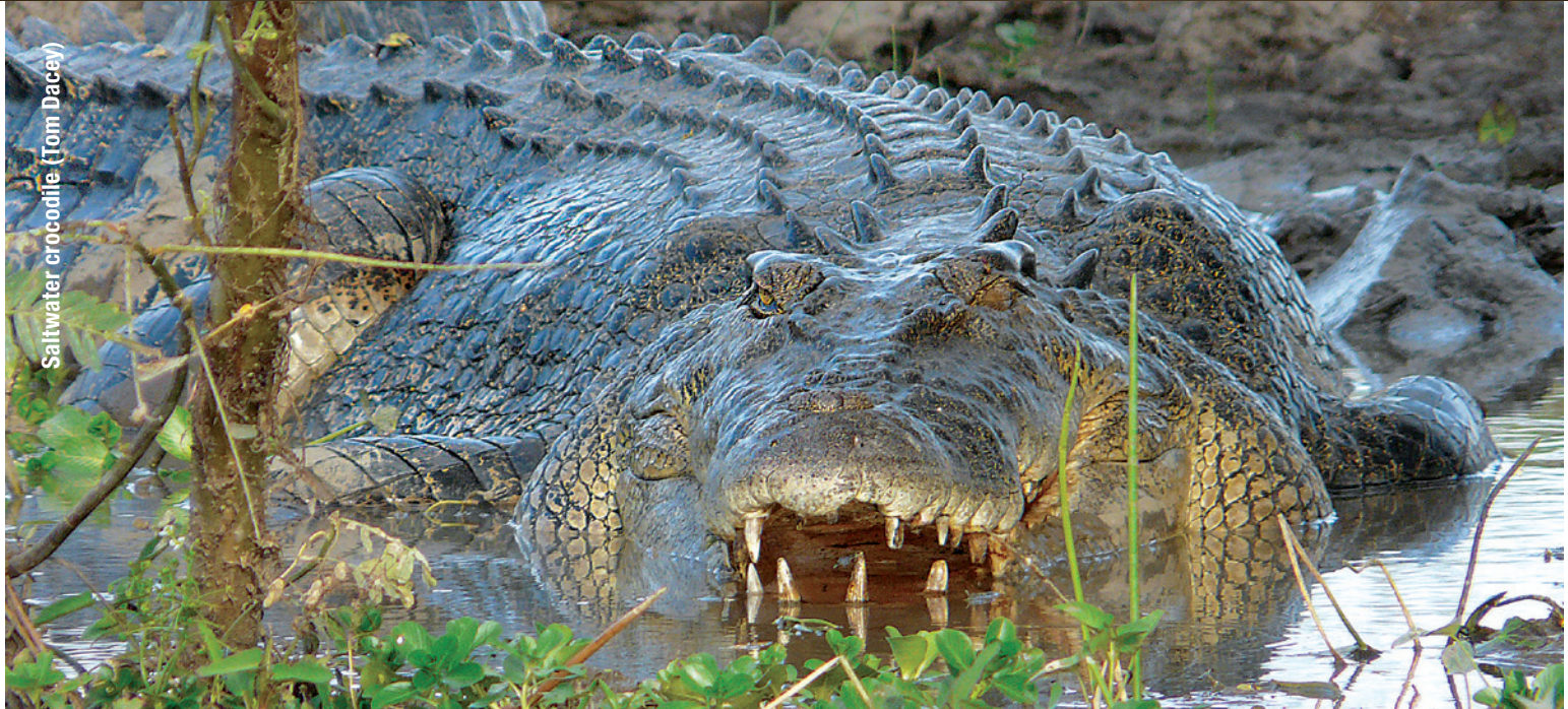
Saltwater crocodile (Tom Dacey)