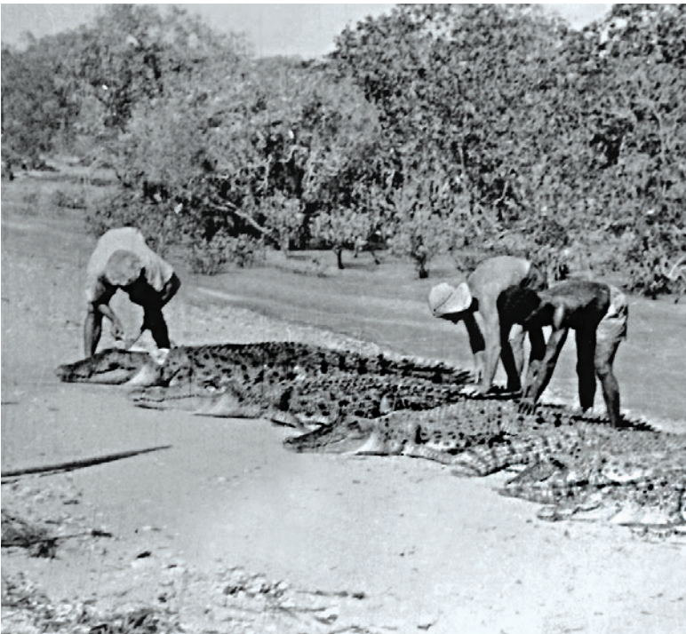
There were an estimated 100,000 wild saltwater crocodiles when commercial crocodile hunting intensified in the late 1940s. By 1958, it is estimated 87,000 wild skins had been exported from the Northern Territory.

In 1946, when high demand for crocodile fashion leather re-emerged after WWII, the Northern Territory was still sparsely populated. The capital city, Darwin, contained around 2000 “white” people. Local entrepreneurs began commercial hunting of crocodiles for skins, within rivers and creeks around the coast, and in coastal floodplain swamps. Eradicating crocodiles was legal and still viewed as a social good. Crocodile hunting was welcomed as a new and novel industry within a remote frontier, where options for economic development were limited by small population size and the tyranny of distance.