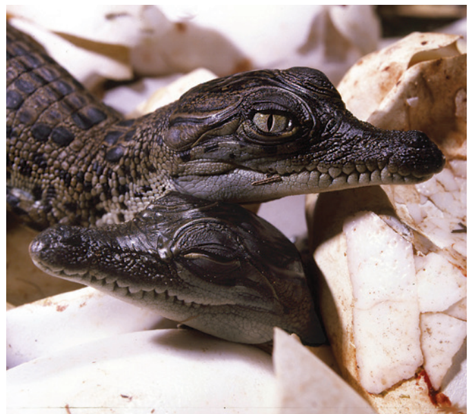
Hatchling saltwater crocodiles (Grahame Webb).

clear that “protection” was working. The population had increased 900% in abundance - 30-40% of the original population recovered. Crocodiles born since protection (1-9 years old; up to 3 m in length) were more common than they had been since the late 1940s. But they were still juveniles, and 4-5 more years would be needed before they matured and could breed themselves.