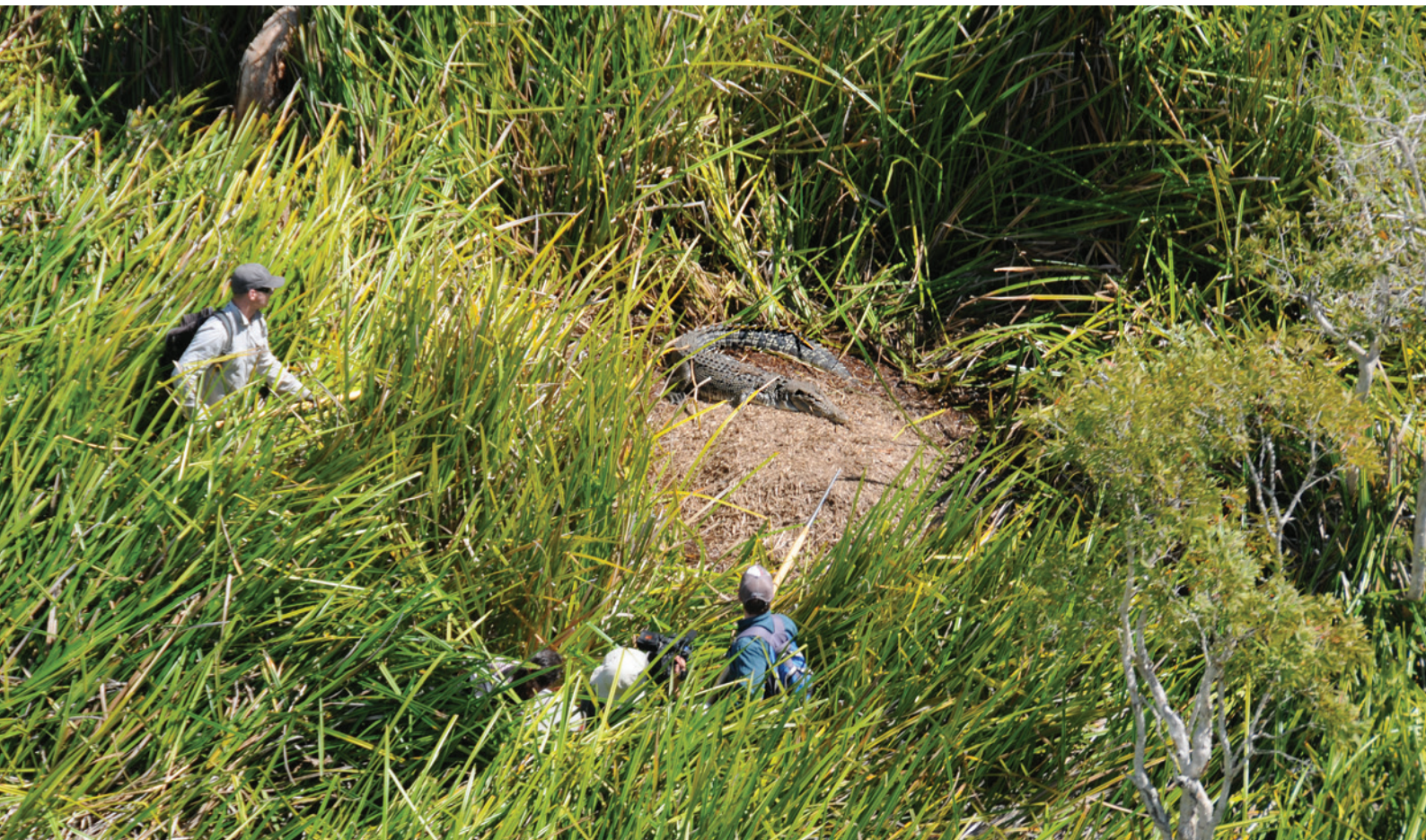
Saltwater crocodile nest within a freshwater swamp (Grahame Webb).

An experimental wild egg harvest (ranching) was introduced in the Northern Territory in 1983. Landowners were permitted to collect and sell wild crocodile eggs to the three crocodile farms established at that time. The farms could raise the crocodiles and sell skins internationally, to the high fashion and luxury goods markets. The more eggs and nests on private lands, the more income generated, and the greater the incentive for landowners to tolerate and conserve crocodiles – an animal previously viewed only as a threat to people and livestock.