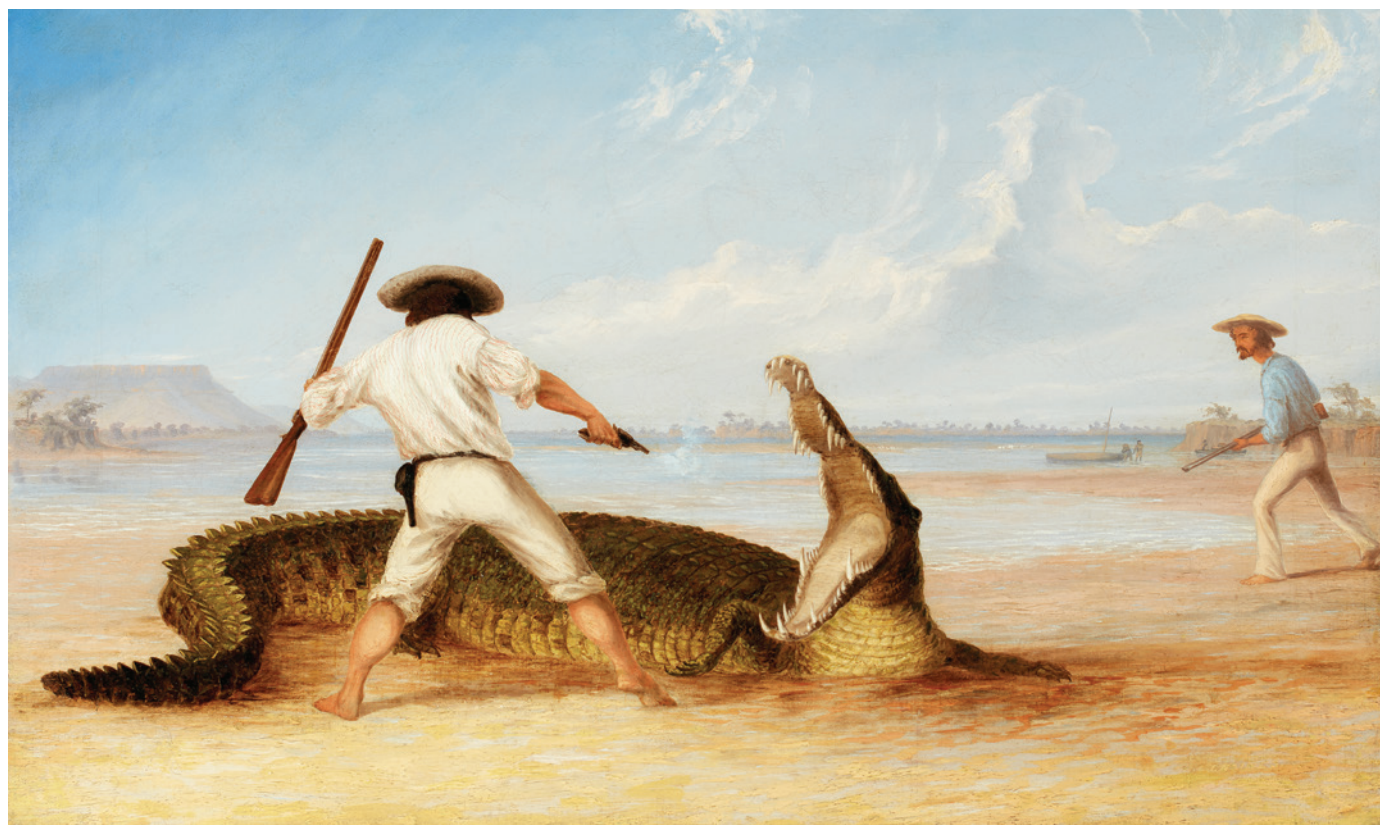
Killing an "alligator" on Horse Shoe flats, Victoria River (Thomas Baines 1855)