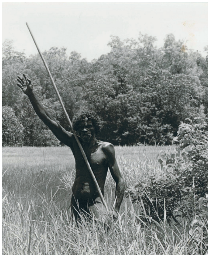
The hunter-gatherer lifestyle of many Aboriginal people has existed from 65,000 years ago to the present time (Bill Green).

European settlement of the Northern Territory is recent – only 200 years or 0.3% of the period of Aboriginal occupation. Early European surveyors and settlers saw crocodiles as pests - fair game for opportunistic sport hunting. But there were few settlers, and many of the wetlands occupied by crocodiles were remote, inhospitable and logistically difficult to access. The impacts of early hunting on the wild crocodile population were minor.