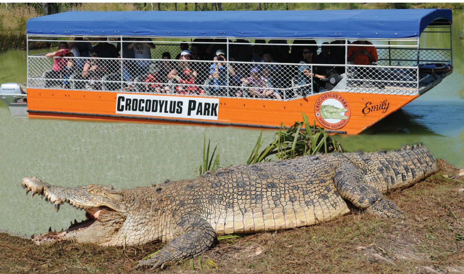
Saltwater crocodiles have become a “must-see” icon for tourists visiting the Northern Territory (Grahame Webb).