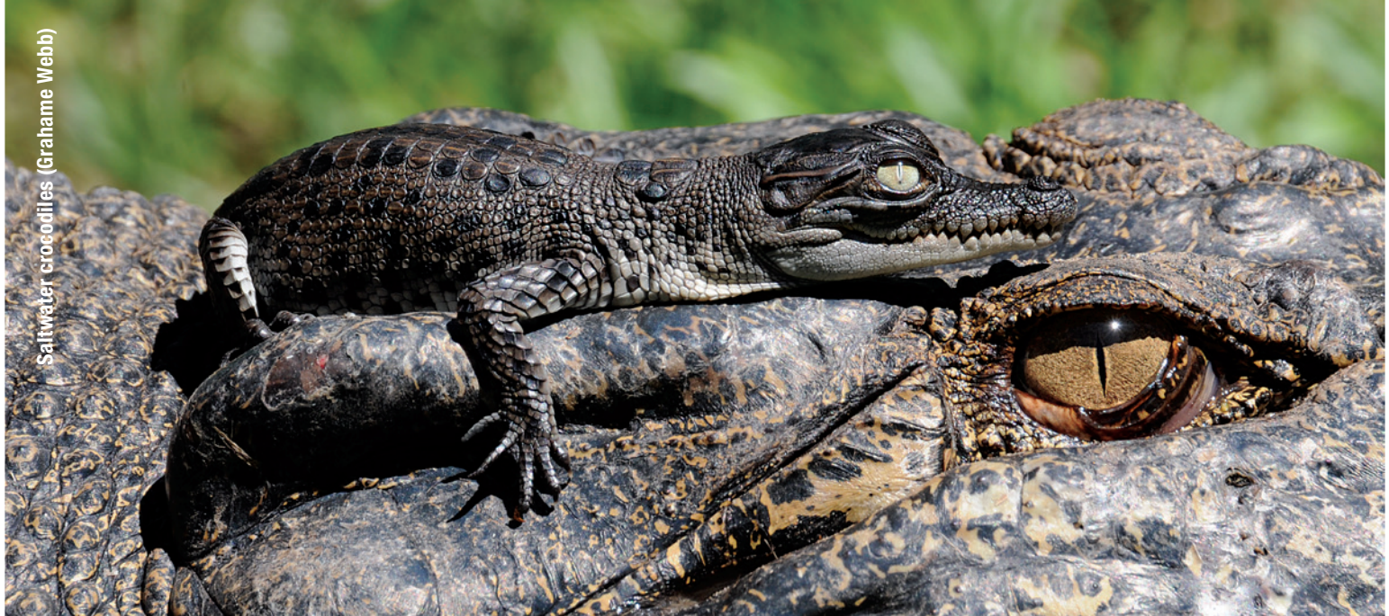
Saltwater crocodiles (Grahame Webb)