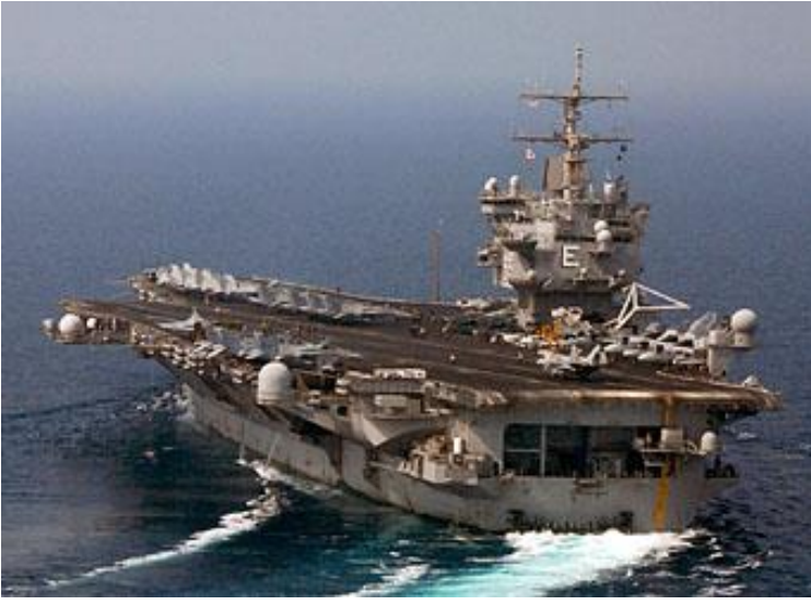
USS Enterprise CVN-65