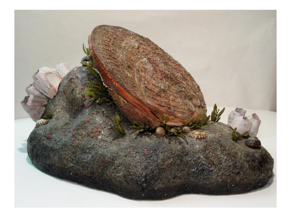
Trophy 10 Inch Scallop