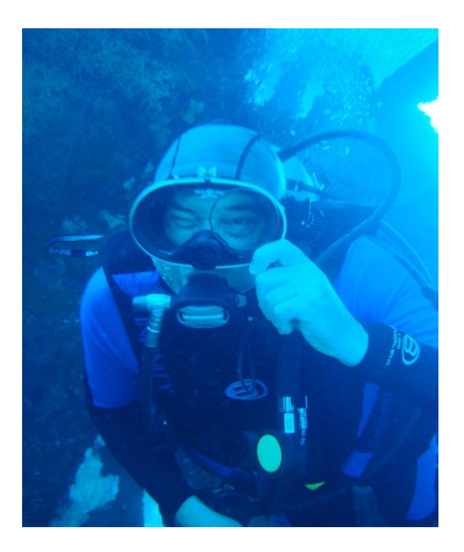
Be Seeing You!