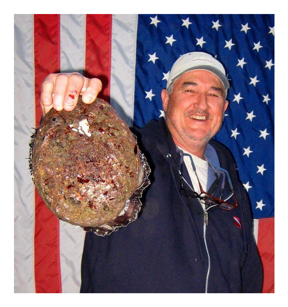
Trophy 10 <sup>1</sup>/<sub>2</sub> Inch Abalone