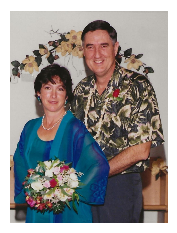
The Wedding 15 Pound Porcini