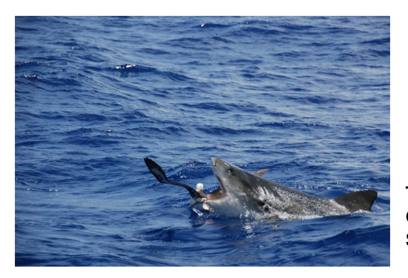
Tiger Shark eating baby Gooney Bird & a P-3 Orion Sub Chaser