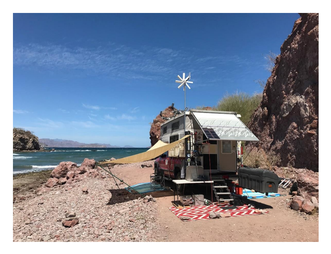
My Favorite Beach in Baja Sur