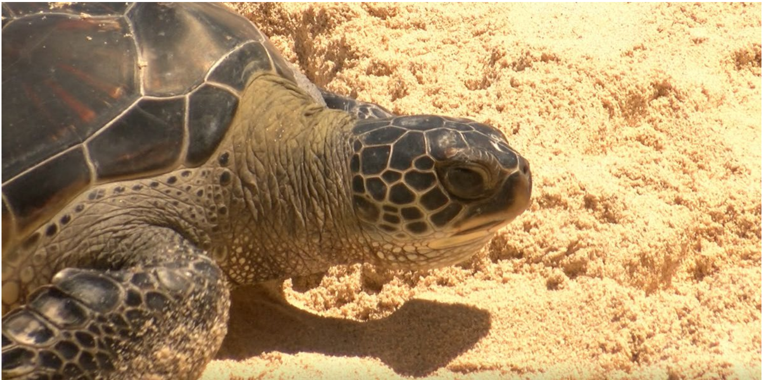
Hawaiian green sea turtle

By HNN Staff | April 22, 2021 at 10:17 PM HST - Updated April 22 at 10:17 PM