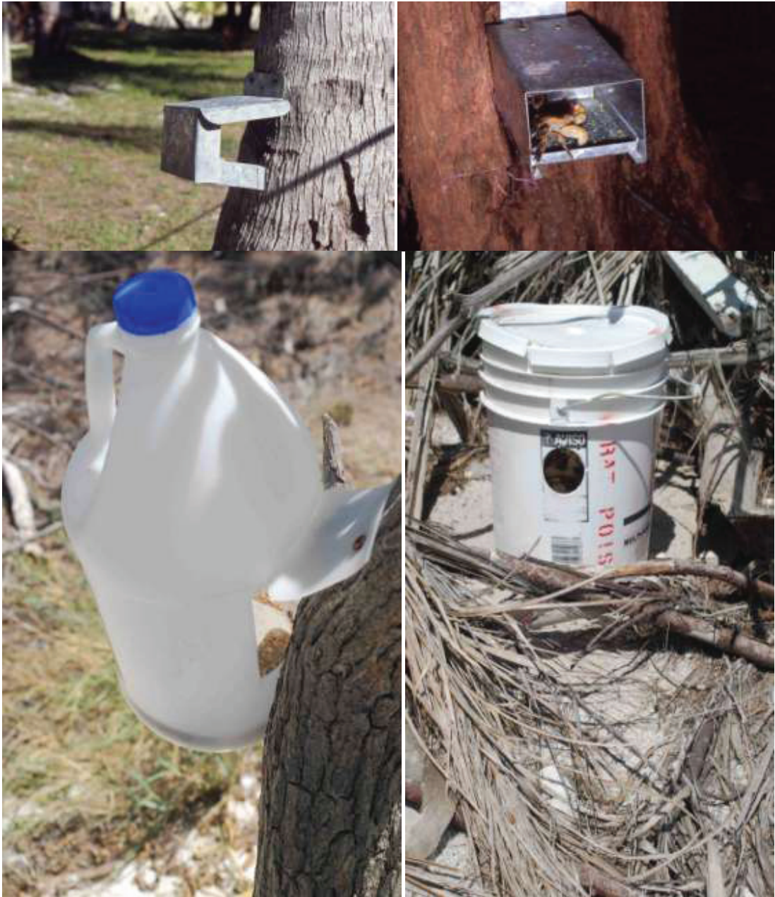
Figures 7-10. Rat bait stations that allow crab interference. Note all locally produced bait stations, except the bucket, are against trees that allow for rats and crabs to enter and take bait. Only the bait bucket, designed by Brian Bell, Wildlife Management International Ltd. of New Zealand excluded crabs.