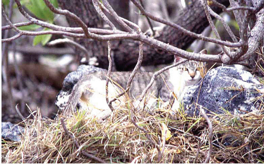
Figure 3: Feral cat on Wake Island

hours (and maintained cats). We also began to attend weekly Buddhist services and other social events. We periodically renewed our education efforts at the Thai beach houses by visiting each one and asking permission to trap around their property. We distributed rat snap traps, answered questions and learned which cats lived where (see Figure 3).