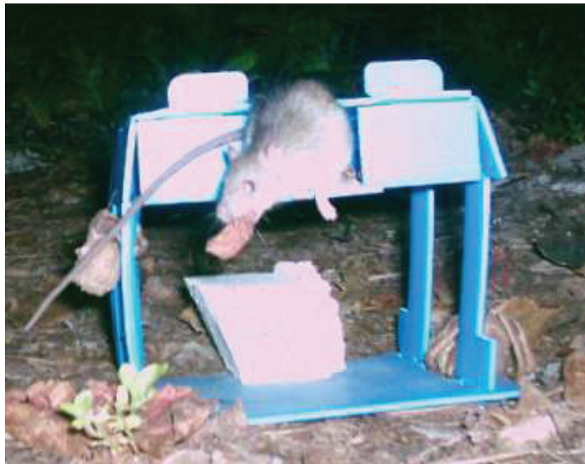
Figure 12. Rat-Go™ Elevated Bait Station with Ship Rat taking bait at Palmyra Atoll, photograph by Alex Wegmann.