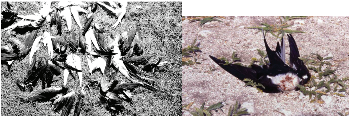
Figures 5 and 6. Cat Predation on Terns

On Wilkes Island, Sooty Terns ( Onychoprion fuscata ) were almost finished breeding and only several dozen fledglings were left to attract the cats. Also a few tree-nesting Red-footed Boobies ( Sula sula ) were killed by cats. On Wake, we noted cats climbing trees to prey on terns and noddies, a new behavior we had not observed before. Their cumulative depredations of arboreal terns are shown in Figures 5 and 6.