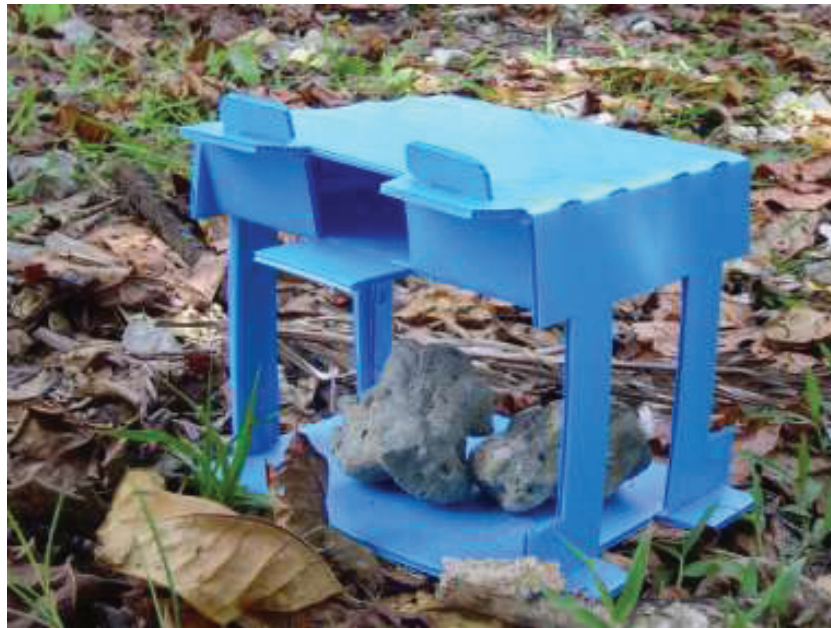
Figure 11. Rat-Go™ Elevated Bait Station