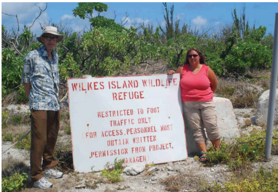
Figure 4. Wilkes Wildlife Refuge Signage.

Our educational efforts made island managers more aware of breeding seabirds. As a result, access to Wilkes Island was restricted, the road gated and posted with a sign designating a Wilkes Island Bird Sanctuary. The island was closed unless permission from island managers was obtained (Fig. 4).