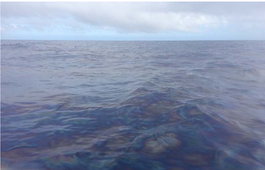
Figure 2. Highest concentration of oil sheen observed south of Pearl Harbor entrance.