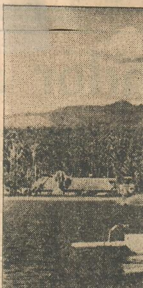
A couple paddles an c in Papeete.

day. Still, compared with Hering's enclave of 1 units, these prices are s