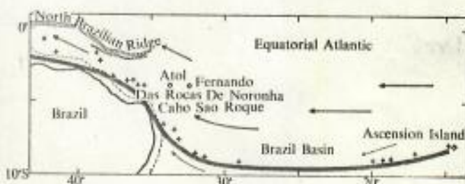
Fig. 4 The western equatorial Atlantic. The arrows indicate the generalised direction of the Equatorial Current (for the northern hemisphere summer). A possible line of seamounts (there are others) is indicated by the vertical crosses. Linking these is a hypothetical migration path (heavy pattern, still to be tested) taken by the Ascension turtles from Brazil to Ascension Island.

This navigatory scheme is simpler than that of Koch et al. (ref 7). In particular, it calls for a smaller plume from Ascension, in keeping with the size and nature of the island, and allows for recognition of Ascension emanations, as a new element, against the African background or 'noise' with which the equatorial current is loaded (the Congo contribution alone is massive). If the sun, in combination with chemoreceptive detection of the Ascension plume, is used as a navigational beacon, there would seem to be a corollary which can be examined: turtles from northern parts of the resident grounds would depart first and those from southern parts (south of Recife) would depart later. This is a necessary consequence of the northerly swing of the sun during the visitation period.