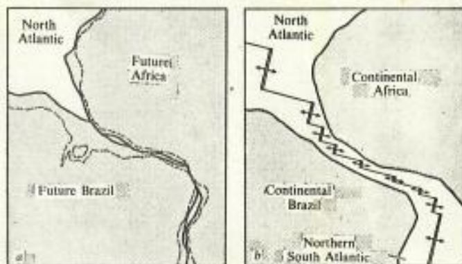
Fig. 1 a, Predrift reconstruction of equatorial 'South America' and 'West Africa', as parts of north-western Gondwanaland, based on the computer-tested bathymetric fit of Bullard et al. (ref 23). b, Reconstruction for the time of about 80 Myr ago. A 'Red Sea' connects the northern Atlantic with the younger southern Atlantic and its youthful spreading ridge. Spreading ridge detail is schematic.

Volcanic piles are a frequent feature of midoceanic ridges, and some may grow sufficiently to emerge as islands. As spreading