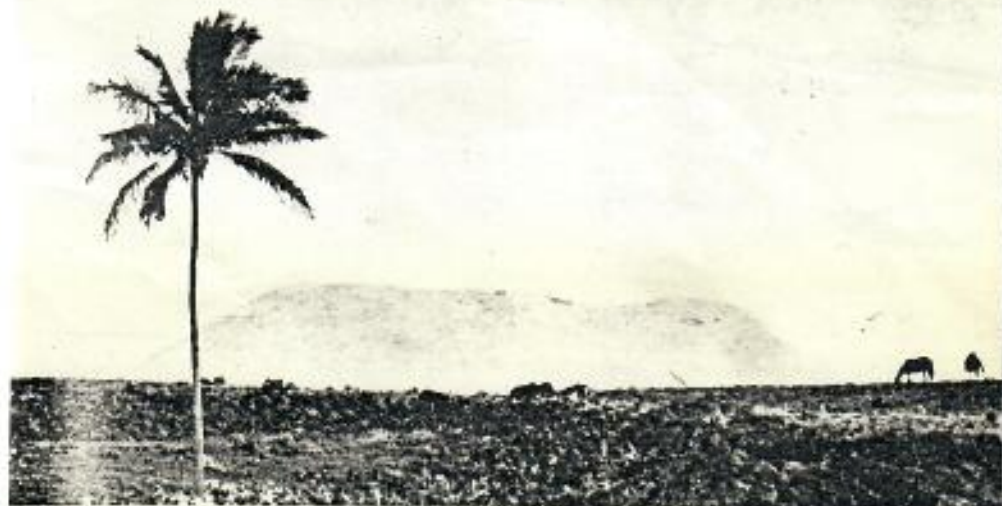
Typical coastal scene on Easter Island with old volcano in the background. The lone coconut-palm and the now feral horses are both introduced.

Despite many past disturbances and present limitations, here we have a uniquely remote tropical ecosystem, which remains of the highest interest by virtue of its physical immunities as well as its unique cultural associations. I suggest the need for closer study, with vigorous support for the Chilean Government. As well as paying the necessary priority attention to conserving the archaeology and prehistory of the island (now actively in hand), attention should be turned to the almost equally immediate problems of the environment there as a whole, including the new hotels and other buildings at present being planned. In such a wonderful, beautiful, completely 'different' place – unspoiled indeed – it would be a tragedy if exploitation were to distort one acre. disappeared. The island has been forested erratically with groves of eucalyptus and other trees. Practically every inch of it not otherwise employed is grazed by the horses and cattle.