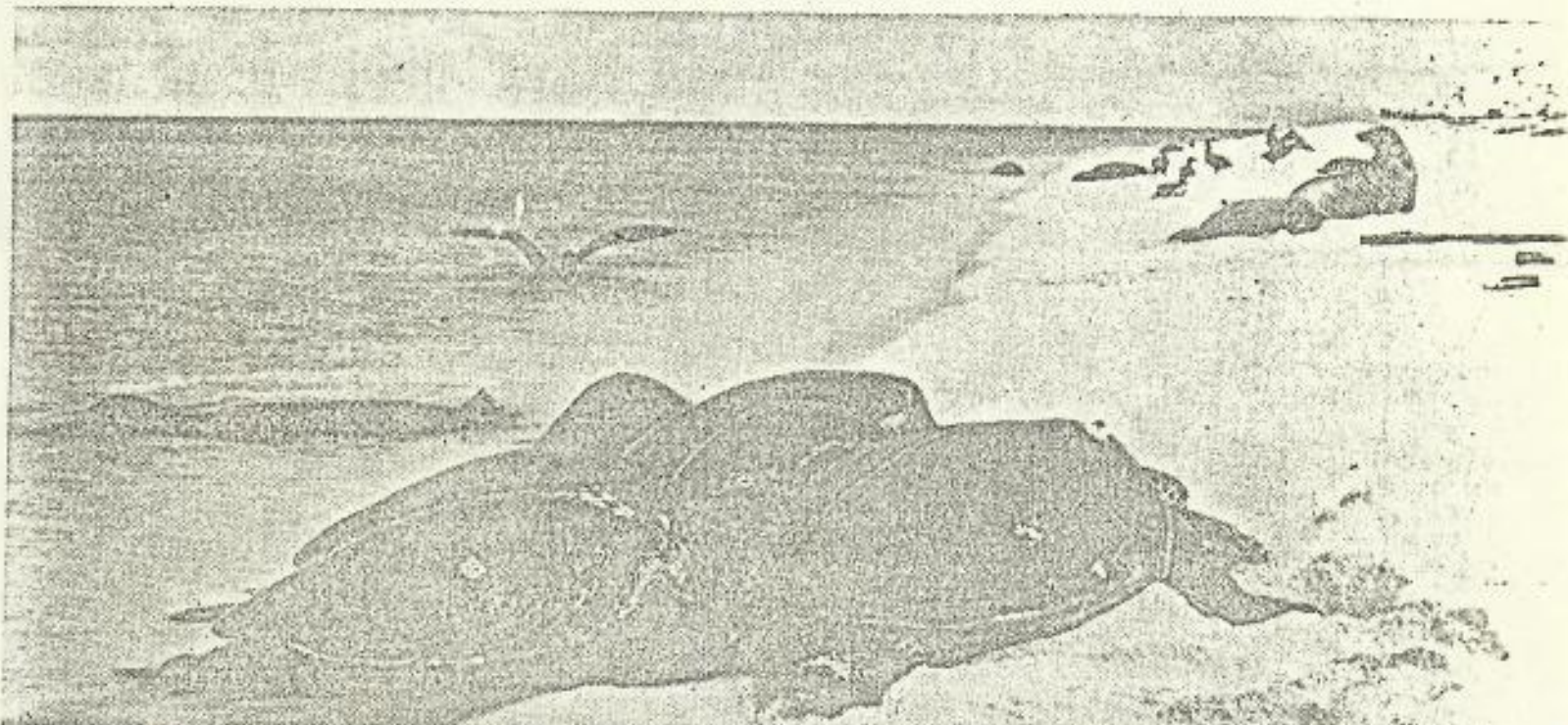
HAWAIIAN WILDLIFE — Green sea turtles bask peacefully in the sun with Hawaiian monk seals and birds at French Frigate Shoals in the northwestern islands of the Hawaiian archipelago. Note the large albatross "chick" in the water. It had just taken off — learning to fly. That's as far as it got.

...ial exploitation is most definitely in an insecure position."