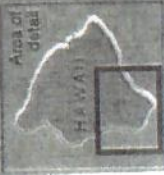
Area of detail