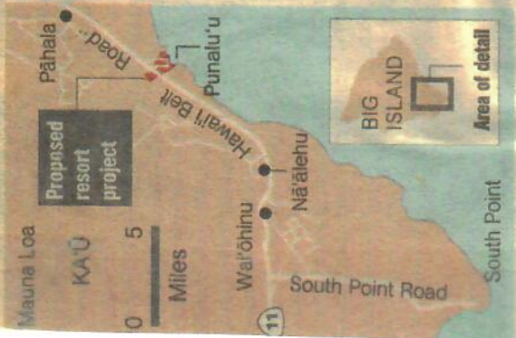
The Honolulu Advertiser

Project includes full-service hotel, up to 2,000 homes