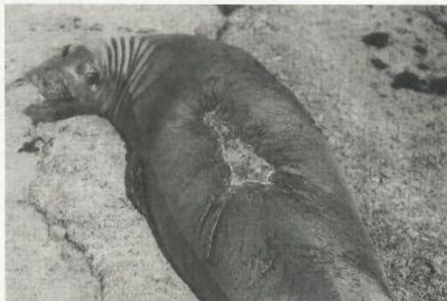
Fig. 3. Typical male-inflicted injury. This gaping dorsal wound is beginning to heal.