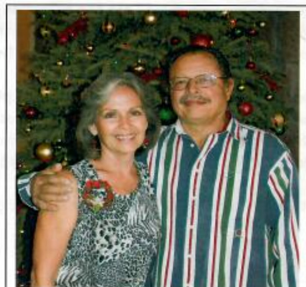
Love & Hugs!!!