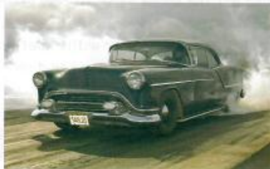
Joey's burn out in the '54 Olds - wow!