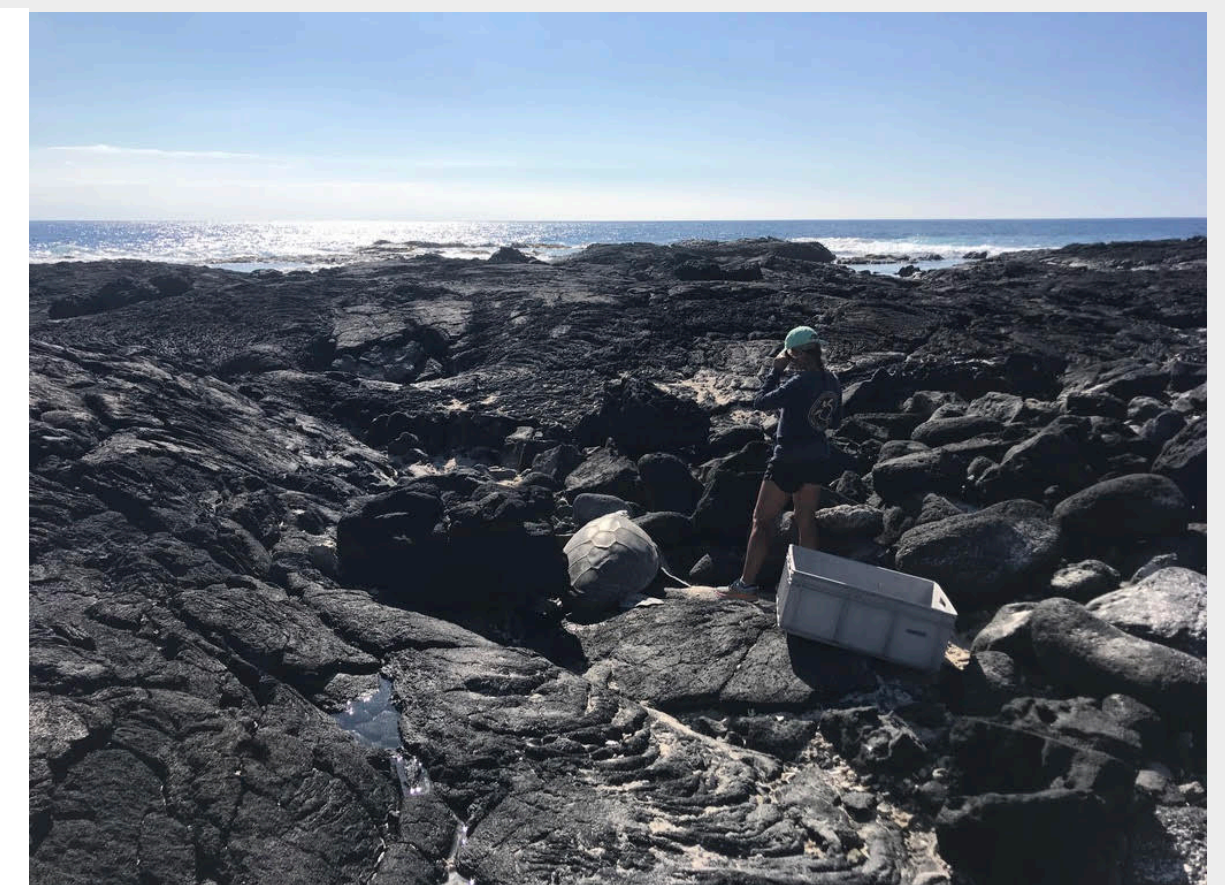
Barnacle Betty stranded on the lava at Kohanaiki on January 11, 2022.

Barnacle Betty was reported stranded on the lava rocks at Kohanaiki (1/11/22) and the HPA STRP staff responded and recovered her. She was alive but had a 3/8" hole in her head (possibly from a spear). She was sent to Honolulu to NOAA for treatment but was too badly injured and was euthanized.