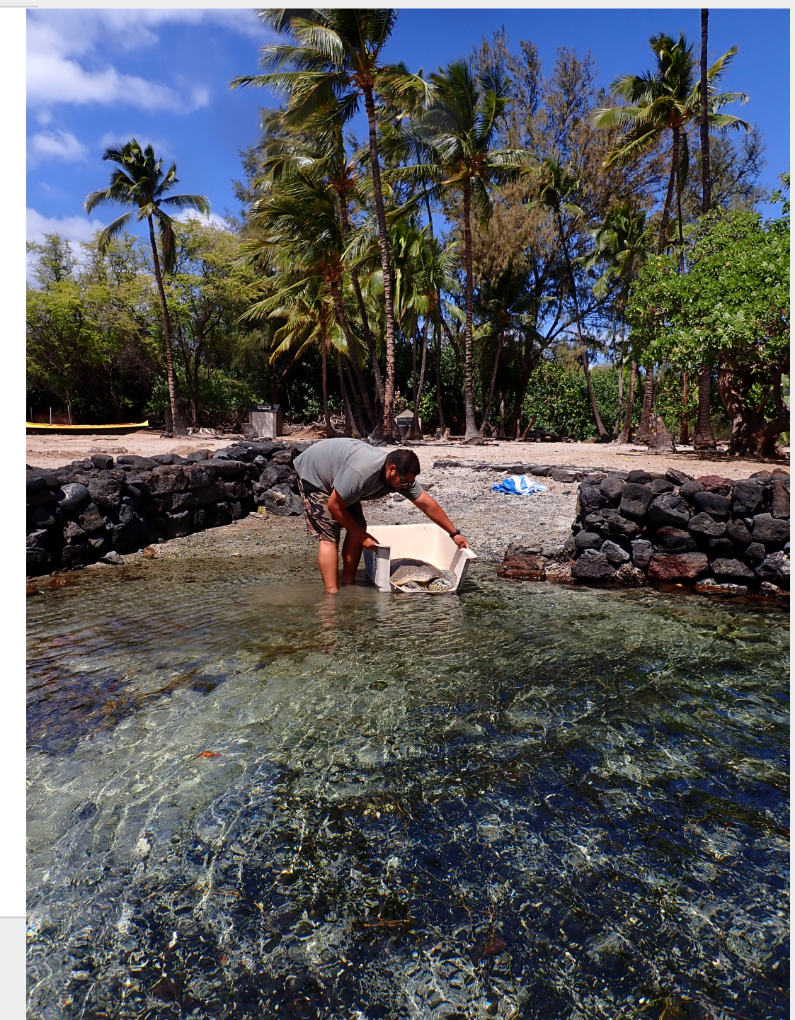
HA85 had a buoyancy problem and needed help.