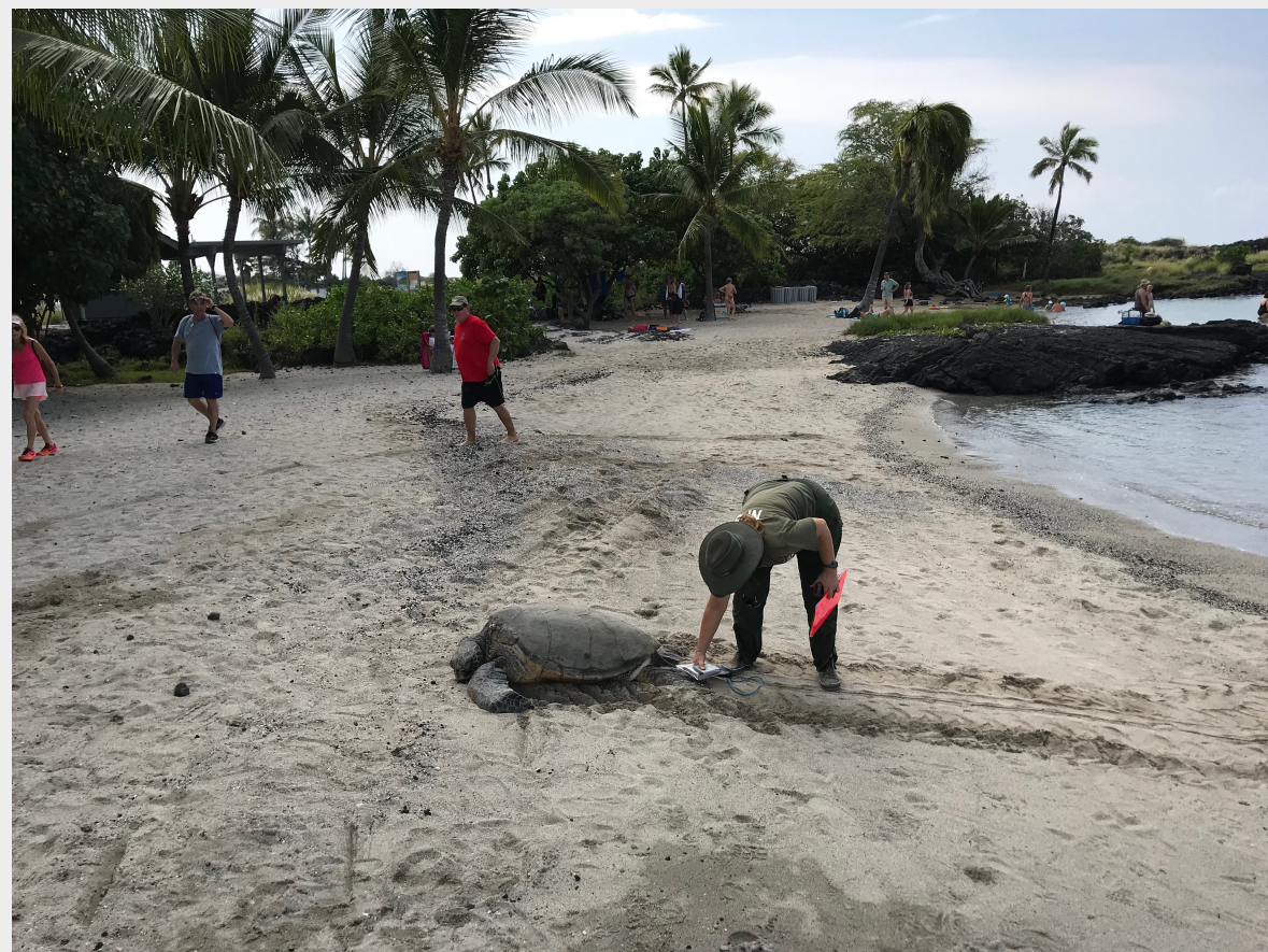
A Honokohau Park Ranger checks the tags on Barnacle Betty on 11/3/17 while she was basking on the beach.

Barnacle Betty was a Mauna Lani released turtle that spent a few years on the Puako reef and then moved to Kaloko-Honokohau where she lived for the next 22 years. Her life history is known because of our research efforts.