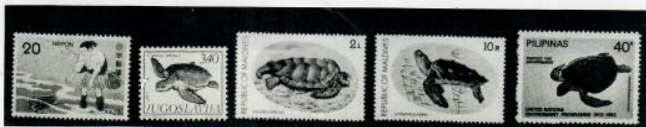
Japan 1204 Jugoslavia 1474 Maldive Is. 842 Maldive Is. 846 Philippines 1590