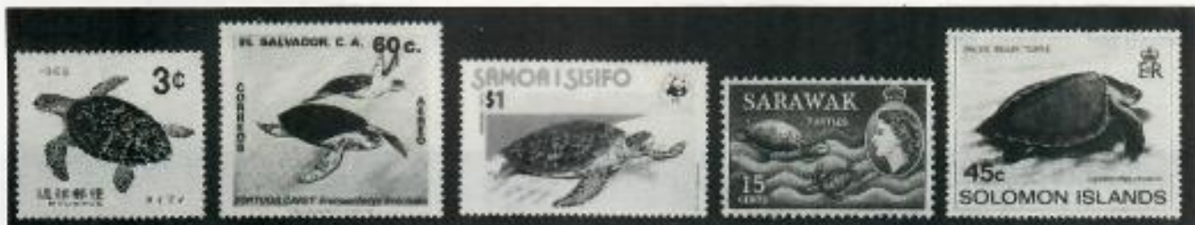
Ryukyu Is. 137 El Salvador SG-1665 Western Samoa 471 Sarawak 204 Solomon Is. New