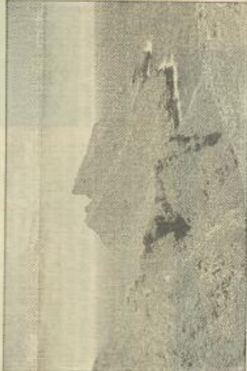
Nihoa Island, 156 acres big, about 150 miles from Kauai.