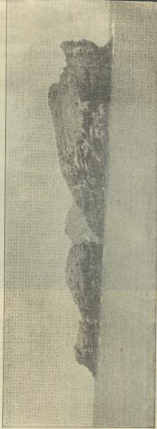
Necker Island, 40 acres big, about 325 miles from Kauai.

Yet when Fletcher Christian and his band of mutineers arrived, they found pillars, house sites, ovens, coconut palms and breadfruit trees, but no human beings. We still don't know what happened to Pitcairn's earliest residents.