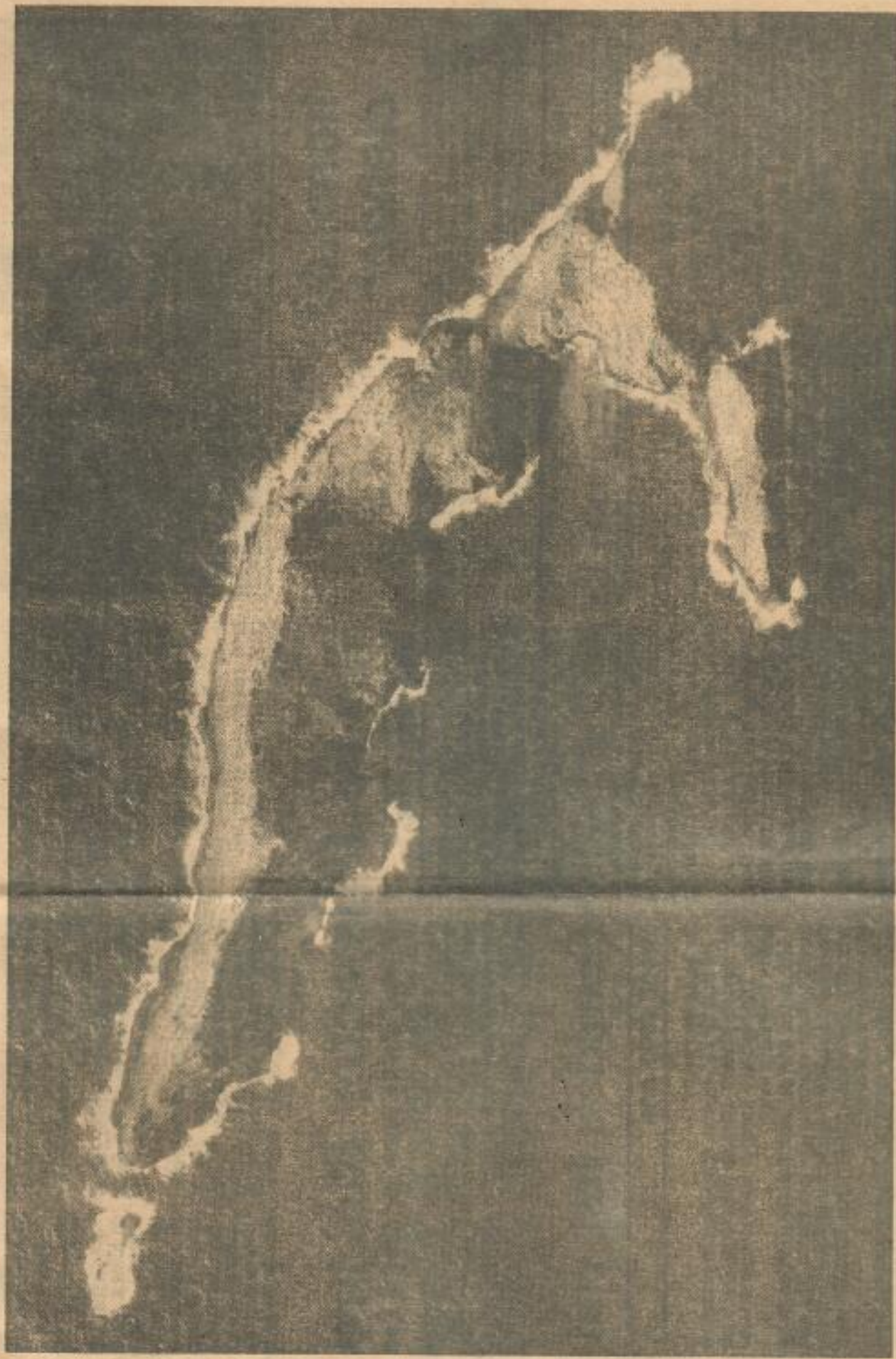
A barren rock about 300 miles west of Kauai, Necker Island is jampacked with Polynesian religious sites. Archaeologists look for clues on whether it was a permanent or temporary living site.

The Honolulu Advertiser ★★ Monday, August 6, 1984 A-3