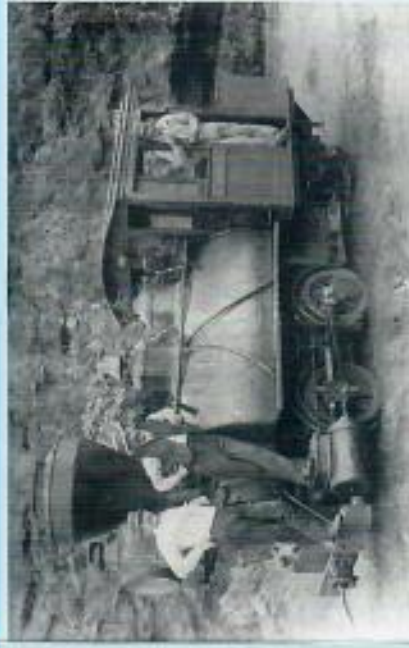
"Hutchinson Sugar Plantation Company Locomotive "Kilanea"