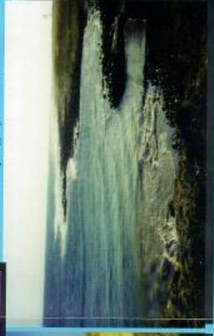
Kaulana Bay and Boat Ramp