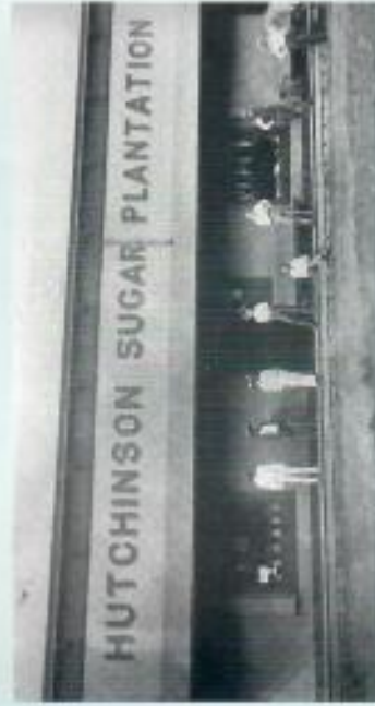
Hutchinson Sugar Plantation Company Store in Na'alehu

1878: Hawaiian Agriculture Company established in Pahala.