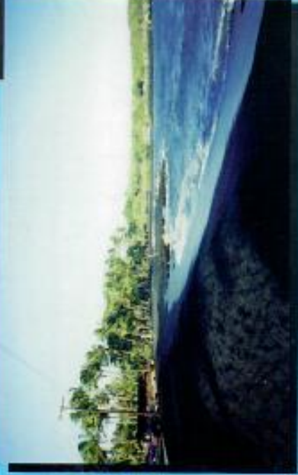
Punalu'u Black Sand Beach A Nesting Ground for the Green Sea Turtle Camping by Permit