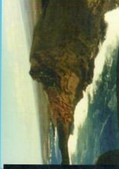
Red Hill along the South Coast (Aerial View)