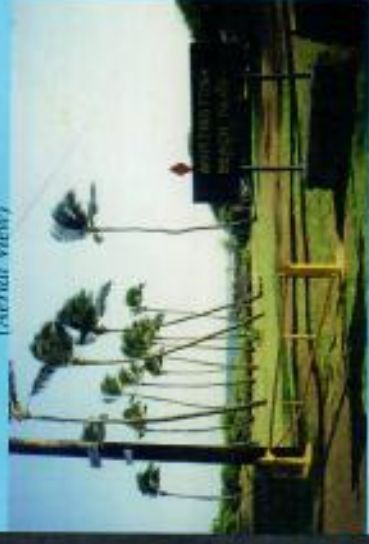
Whittington Beach Park at Honu'apu Camping by Permit