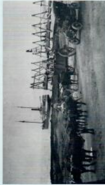
Hono'apo Landing with Steam Ship and Bullock Cart 1912

1823: William Ellis and a group of Protestant missionaries make a religious survey and estimate the population of Ka'u to be 5,000 to 6,000 persons.