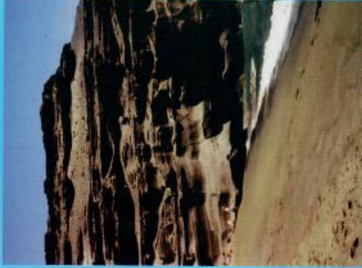
Mahana Bay or Green Sands Beach About a 45 minute hike along the coast