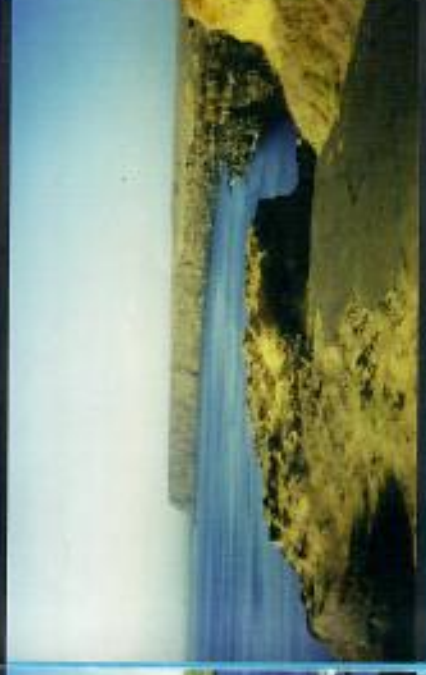
The Cliffs Along the Coast of South Point