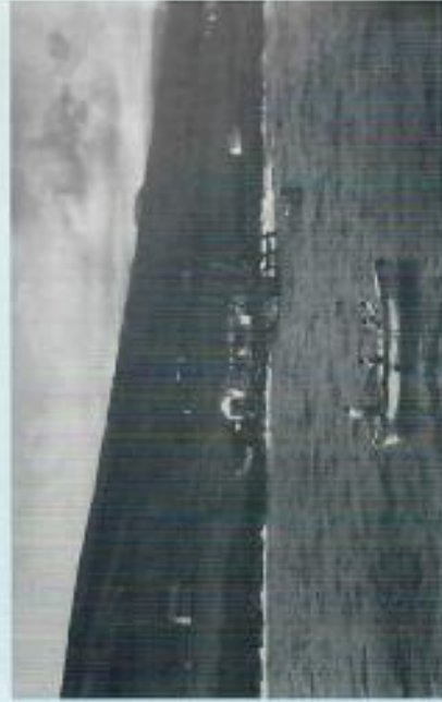
Honu'apo Landing and village 1908

1779: Captain Cook's expedition sails around the Ka'u coast looking for a suitable harbor and William Bligh comes ashore to look for water.