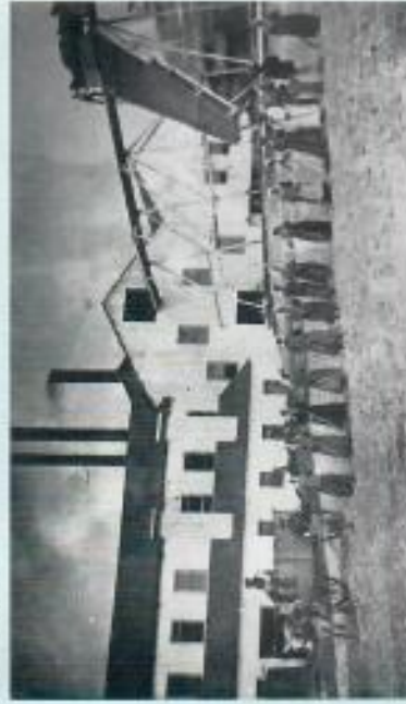
Drying bagasse for fuel at Na'alehu Sugar Mill