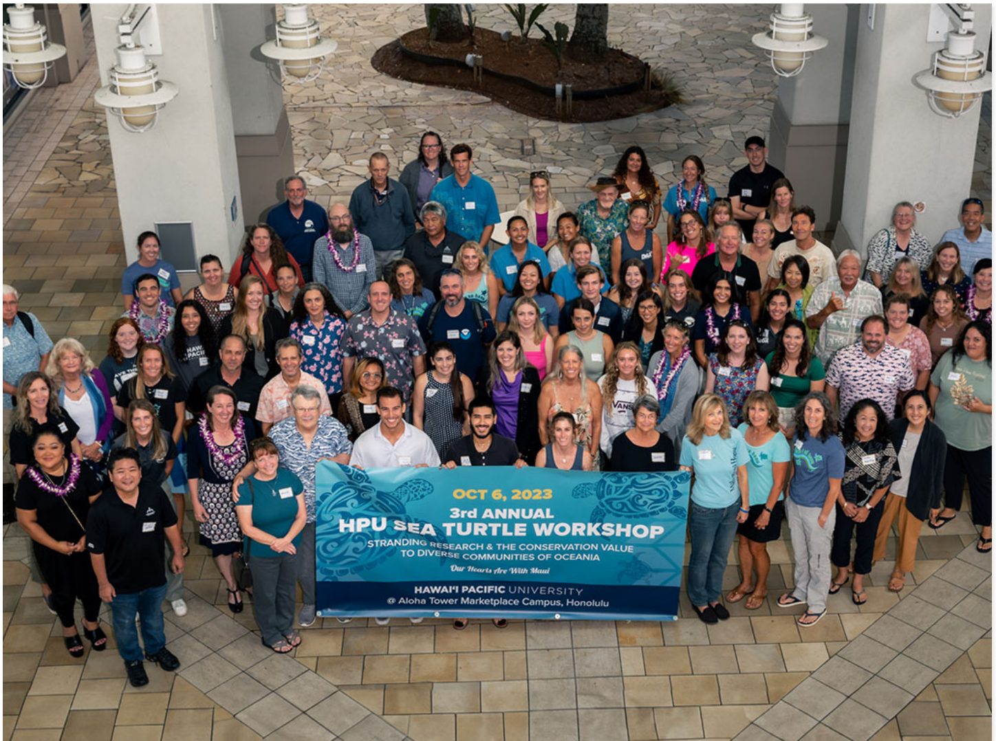
Individuals committed to sea turtle conservation and research came together at HPU for the university's 3rd annual sea turtle workshop.