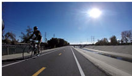
Near Rynerson Park in Lakewood

The San Gabriel River Bike Path Rehabilitation project involves re-paving, striping the pavement, and updating the gates on the section of path from the Whittier Narrows Dam to Florence Avenue.