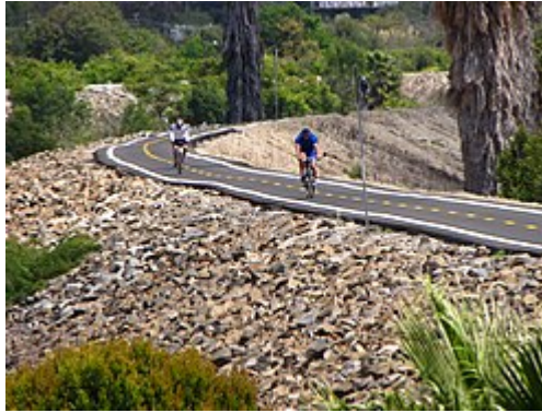
The trail along the southern segment of the San Gabriel River