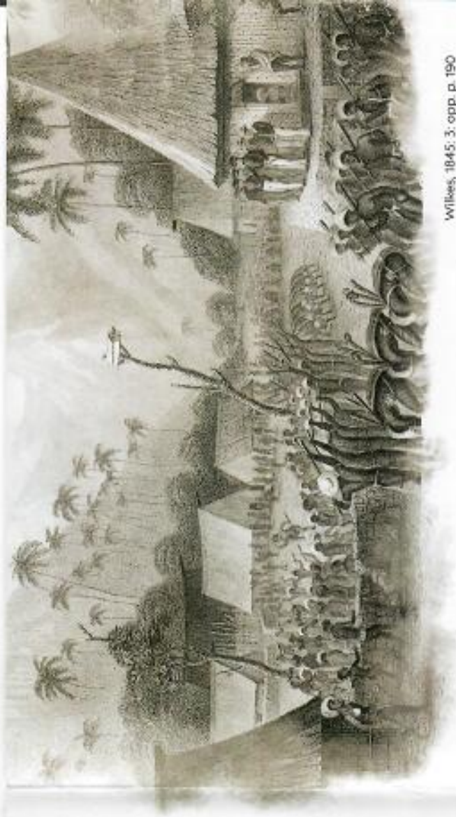
Wilkes, 1845: 3: opp. p. 190

Voyages: Stories of an Ocean People gives you the opportunity to connect with an ocean legacy, while challenging you to consider what ocean legacy you are leaving as we all navigate a warming world.