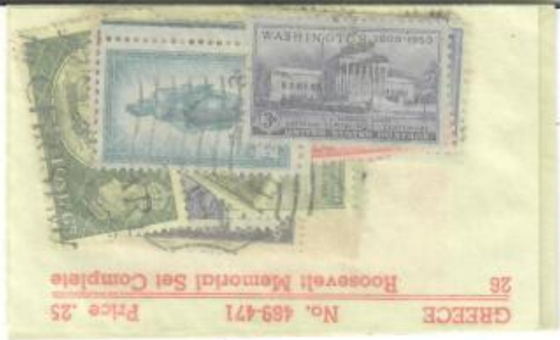
GREECE No. 489-471 Price .25 Roosevelt Memorial Set Complete 26