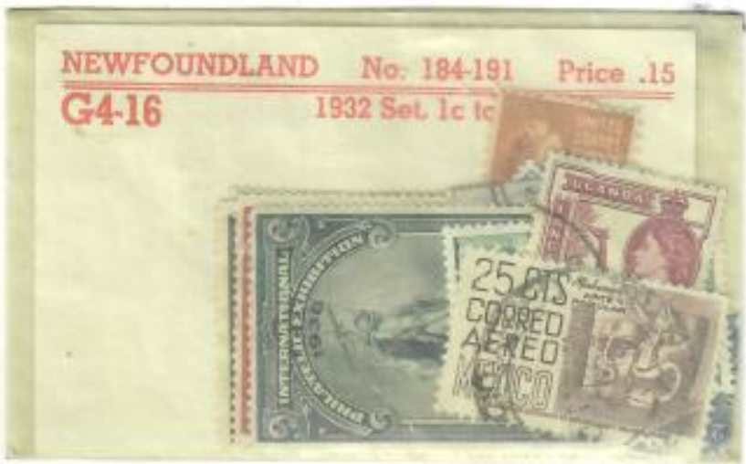
NEWFOUNDLAND No. 184-191 Price .15 1932 Set, 1c 1c G4-16