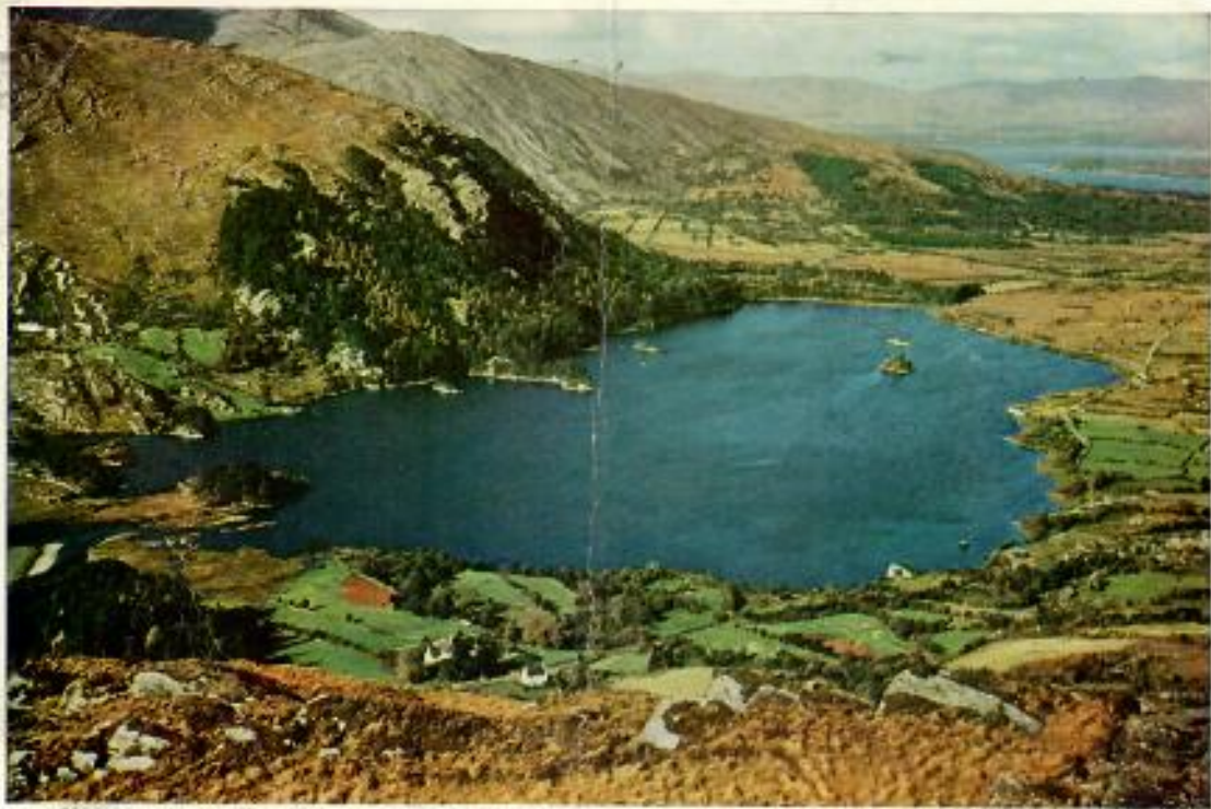
Glanmore Lake, Co. Kerry, on the Healy Pass between Kenmare and Glengariff, Co. Cork, Ireland.