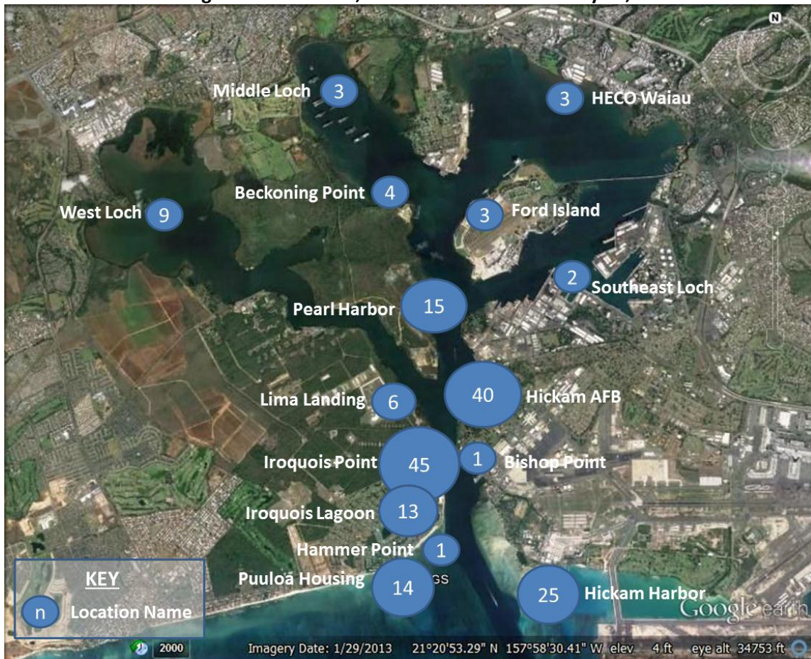
Figure 2: The number of stranding events is mapped by location to show hotspots in which turtles were found within Pearl Harbor and adjacent areas. Each circle contains the number of events recorded in that location by TRP.