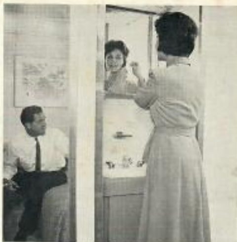
Stateroom Bath—Sea Racer