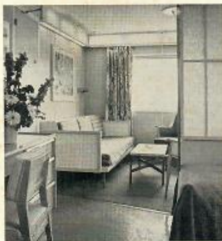
Lanai Suite—Sea Racer