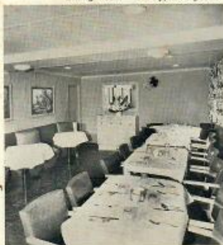
Dining Room—C-3 Type Cargoliner