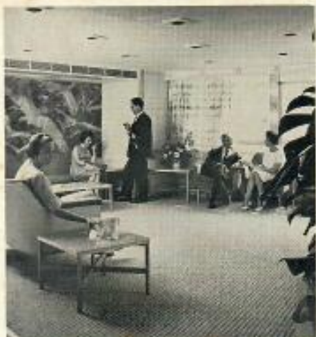
Main Lounge—Sea Racer