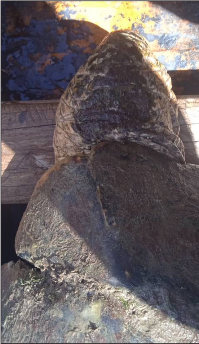
Figure 4. Elongated tail of the adult hawksbill turtle incidentally captured in Venezuela.