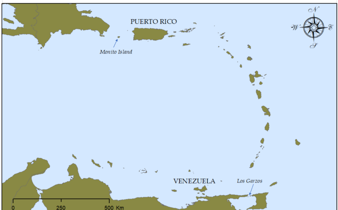
Figure 1. Geographic locations of Monito Island (Puerto Rico) and Los Garzos (Venezuela).