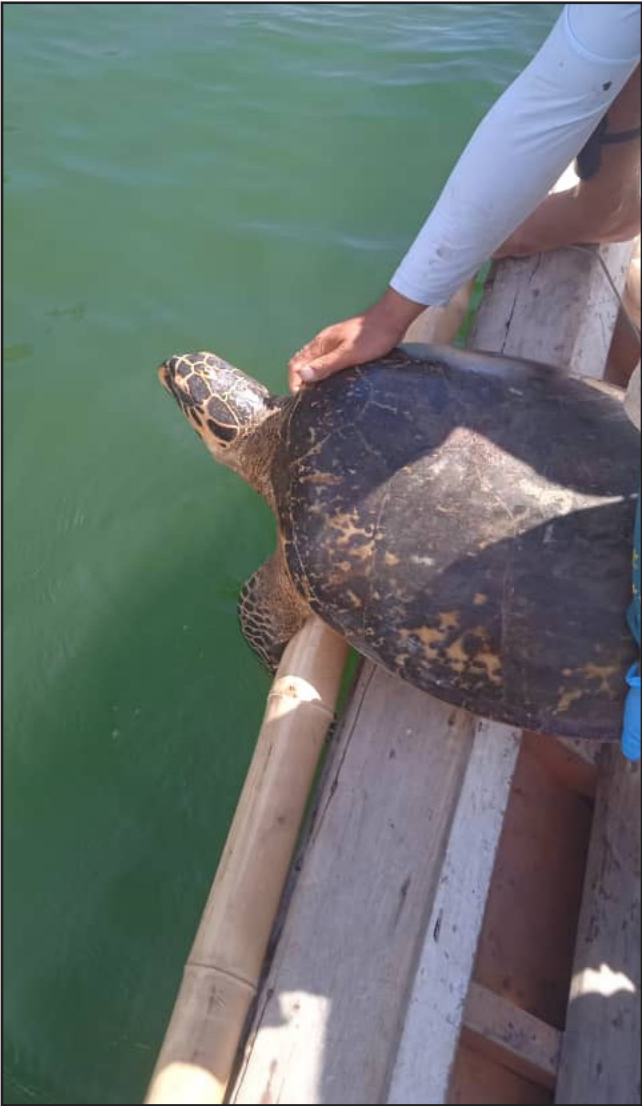
Figure 3. Recapture of the tagged adult hawksbill turtle with 76 cm curved carapace length in Venezuela.