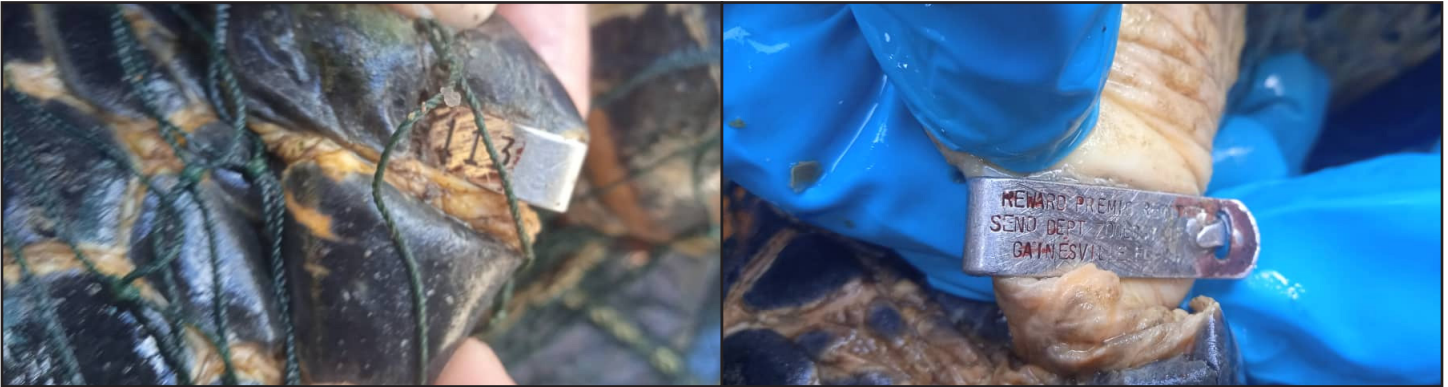
Figure 2. Condition of the 25 year old Inconel tag on a hawksbill turtle incidentally captured in Venezuela after being initially tagged in Puerto Rico.