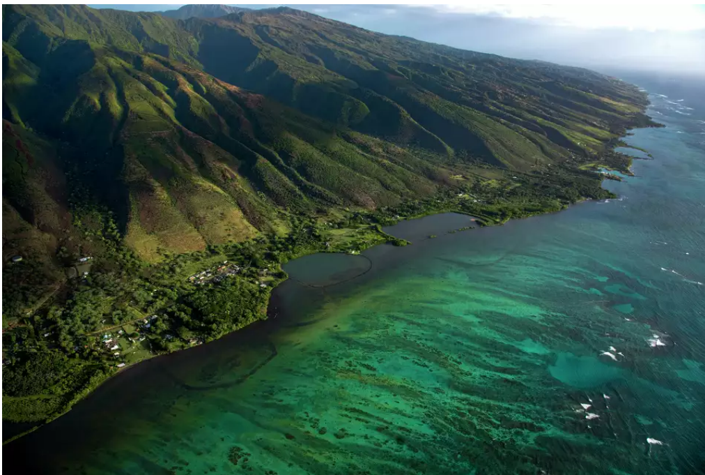
Molokai, nicknamed the “Friendly Isle,” is the fifth largest island in the main Hawaiian island chain.