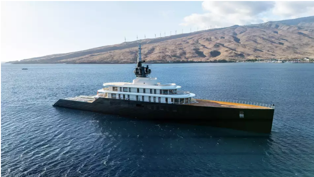
A megayacht owned by a commercial real estate billionaire made stops in Maui and Hawaii Island before arriving at Molokai.