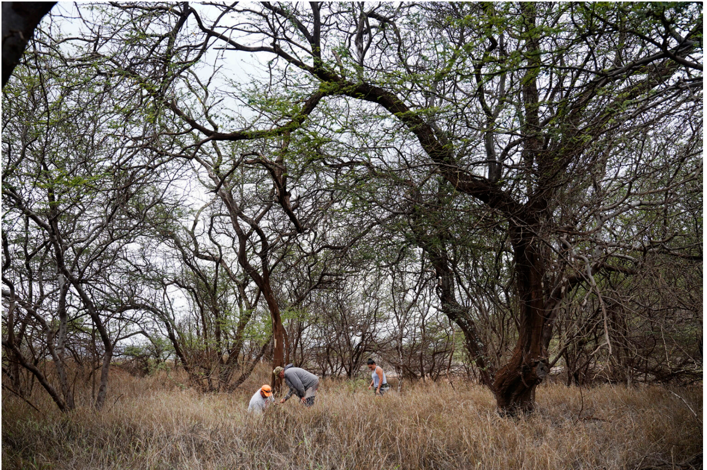
Kua CJ Elizares, from left, Lopaka Aiwahi and Nāmaka Whitehead prepare an area surrounded by invasive kiawe trees for planting native plants.