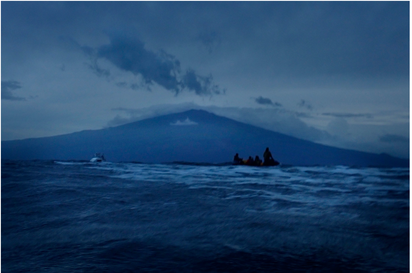
Boats carrying Protect Kaho‘olawe ‘Ohana crews arrive before dawn at Hakioawa Bay as Haleakalā’s silhouette appears in the distance on Maui.