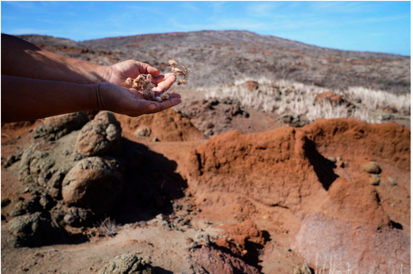
A volunteer prepares to release seeds upwind from the group's base camp so they might scatter back toward that area.

The landing of the nine activists led to a movement guided by one of its key participants, Noa Emmett Aluli, dubbed Protect Kaho'olawe 'Ohana , or PKO, a nonprofit.