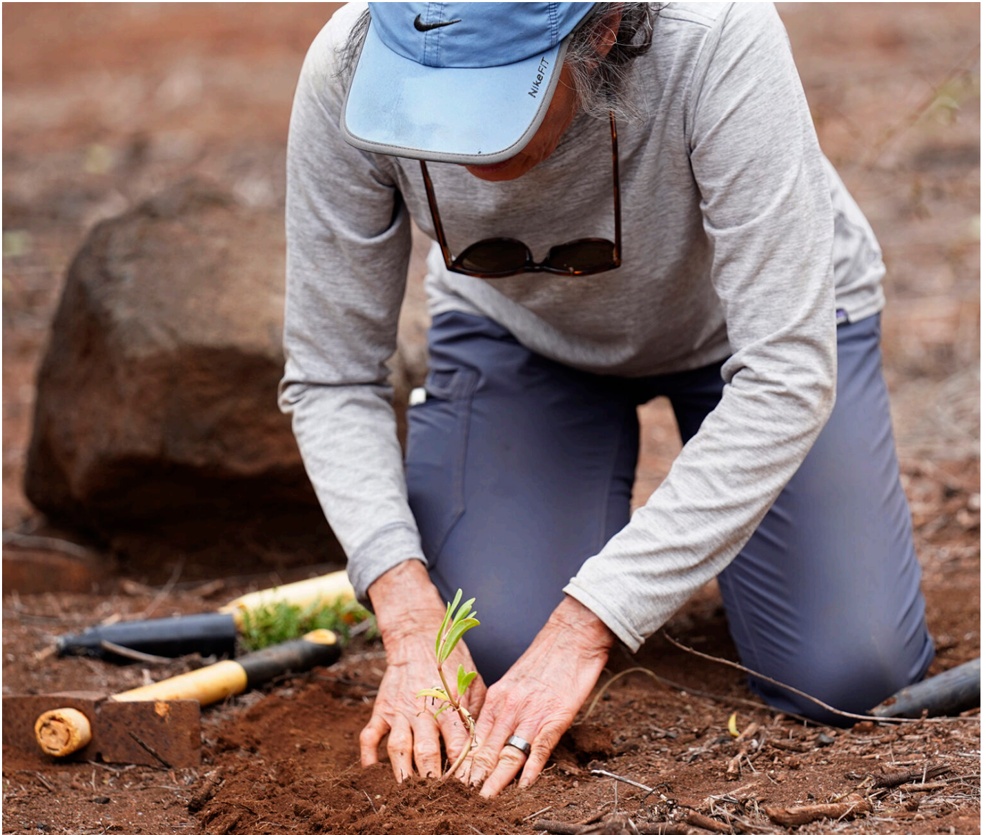
Volunteer Anna Palomino plants a native 'ākulikuli.