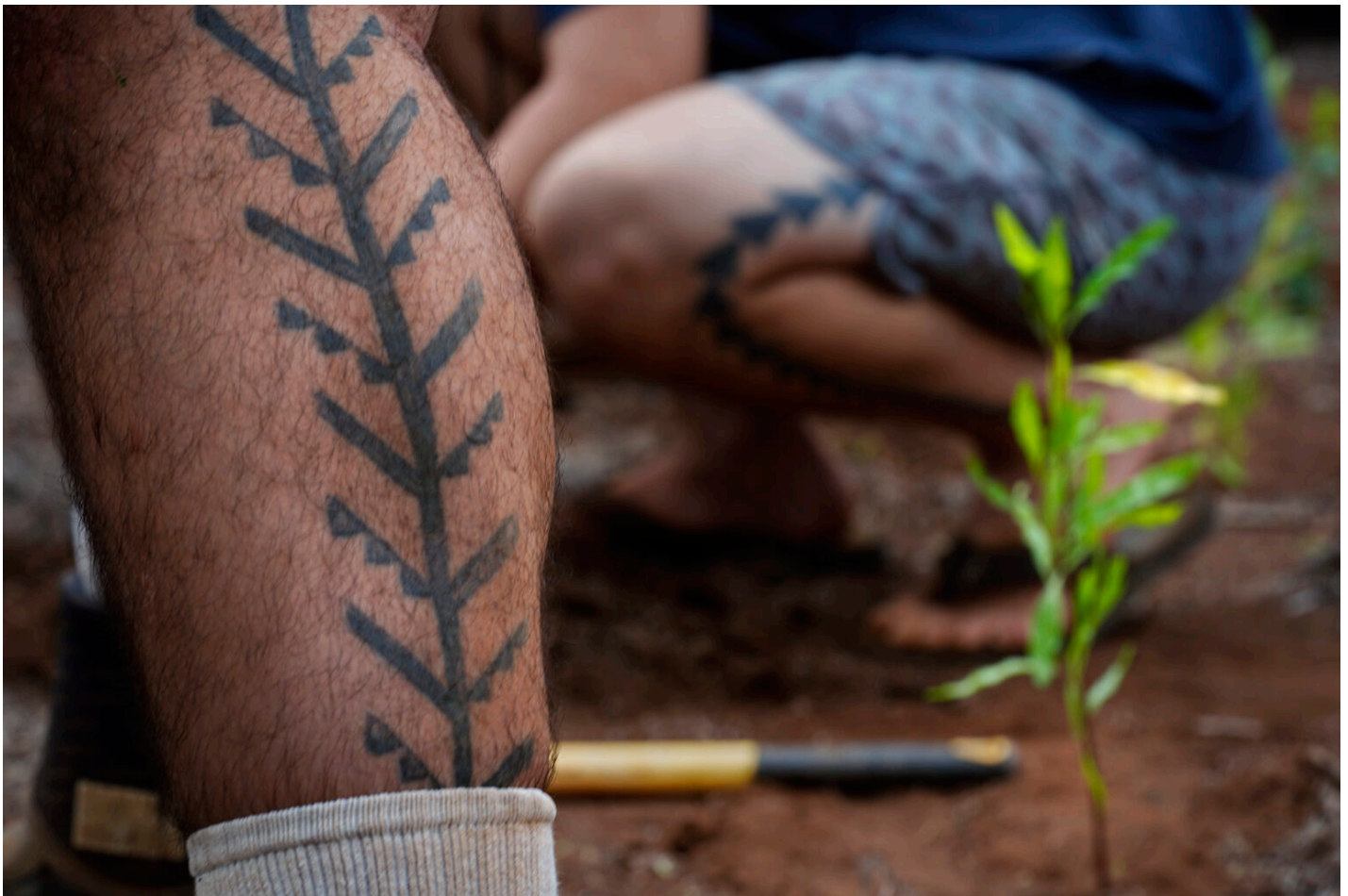
A tattoo mimics fresh native plants going into the ground.

The answer centered on Lono, the Hawaiian deity of agriculture and rain. Practitioners now ask Lono to bring over the clouds and rains from Maui during what’s known as Makahiki , a roughly four-month stretch of Hawai‘i’s rainy season, to help heal the landscape.