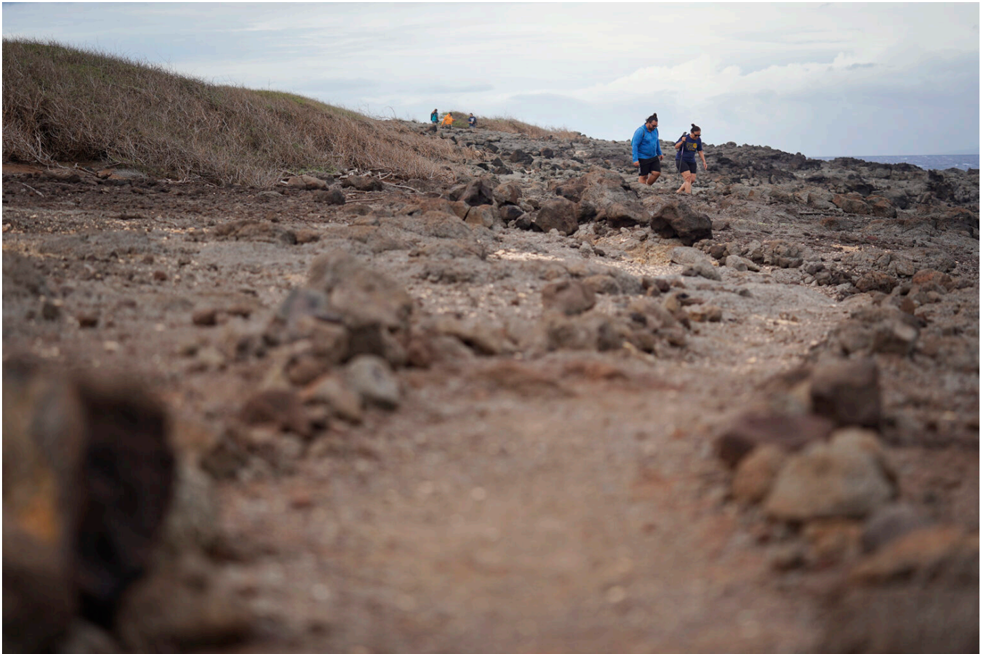
Kaipu Keala and Davianna Pomaika'i McGregor walk on a trail built and maintained in areas cleared of unexploded ordnance.