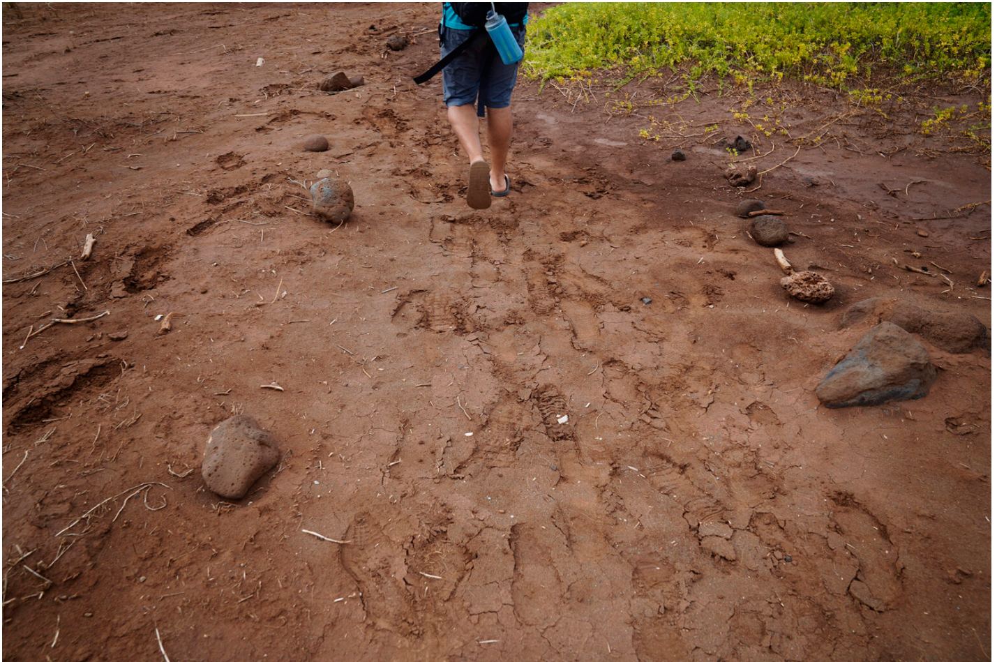
Most of the area at Hakiowa has been cleared of UXOs.