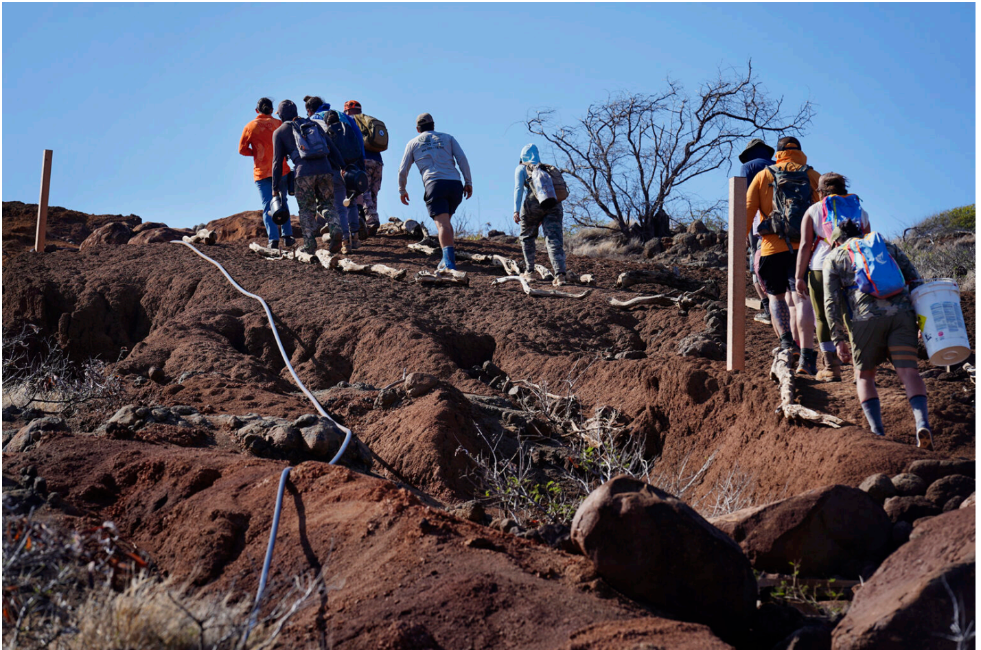
PKO members ascend a trail built in areas cleared of unexploded ordnance.

After a full day's work, the PKO members huddle in the solar-powered light of the Hakioawa base camp to discuss ideas for a 30-second television spot they'll air during the upcoming Merrie Monarch Festival, one of Hawai'i's premier cultural events.