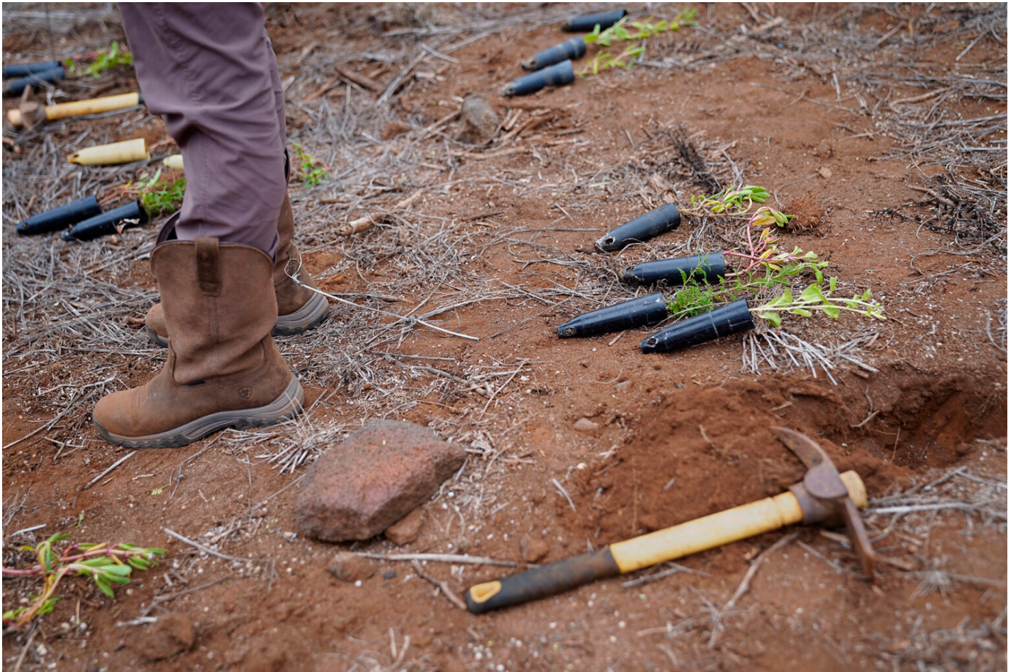
Volunteers prepare native plants at Hakiowa.