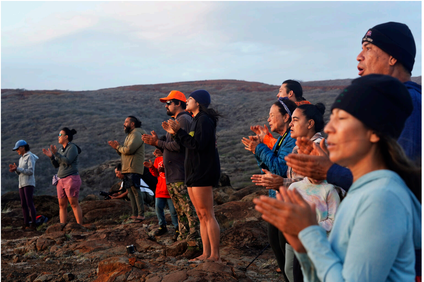
PKO members deliver a sunrise chant, or oli, during a trip marking the 50th anniversary of the Kaho'olawe Nine landing.