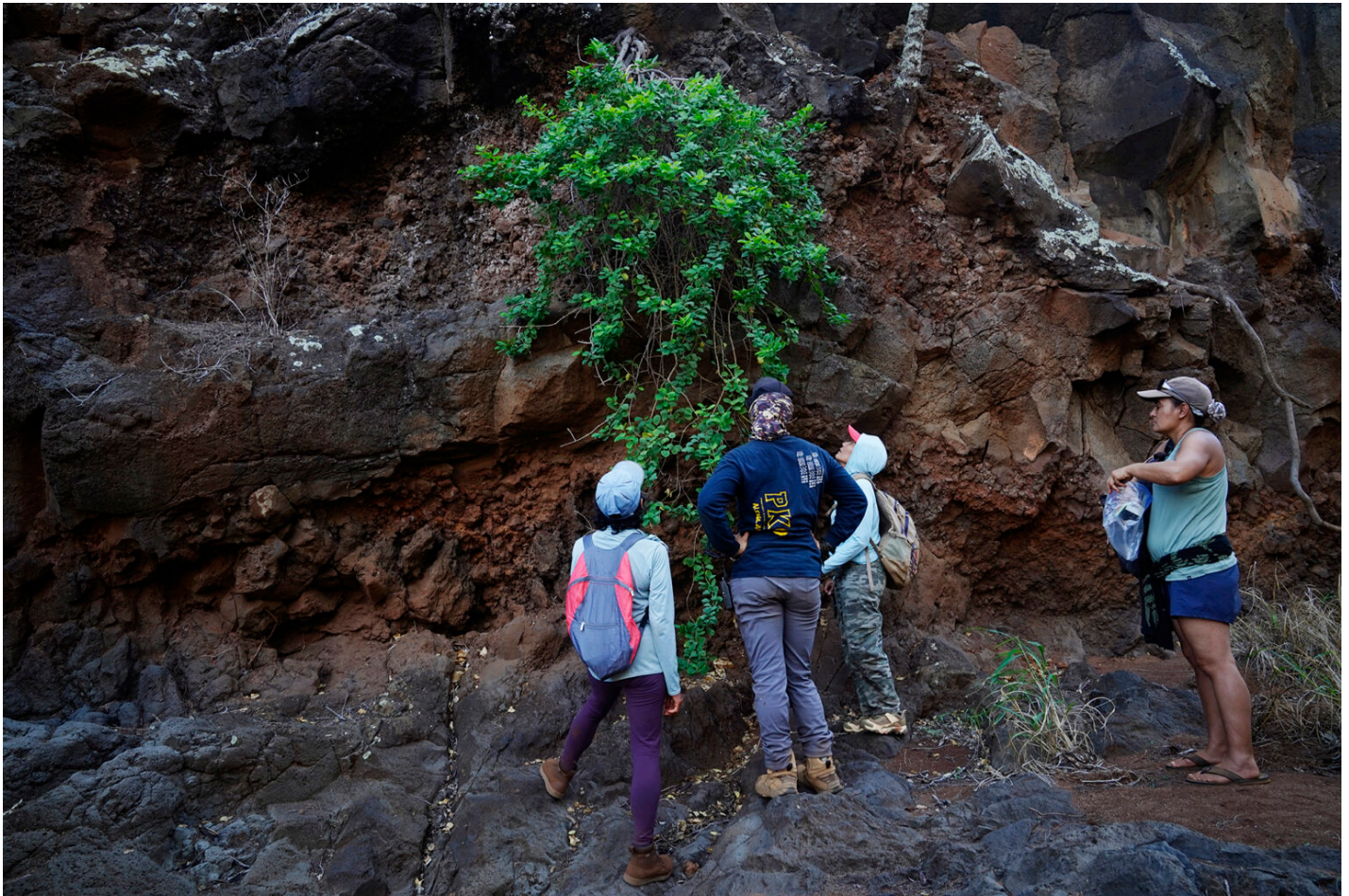
A threatened endemic maiapilo grows from the side of a river wall upstream from the PKO camp.

Pilgrims march across the center of the island on a UXO-swept route during rituals that are kapu — sacred and private. Only the participants themselves are meant to be there.