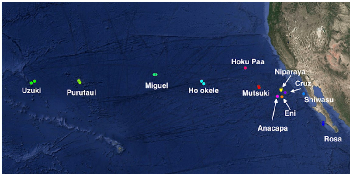
Cohort II locations as of 4/20/2026.

Cohort III's locations are shown below also.